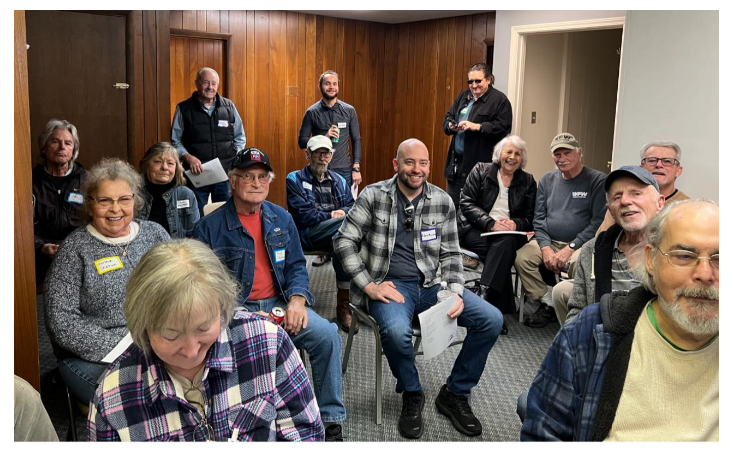
It is inspiring to see all this Democratic activity in Cherokee County – North Carolina's most far western county!