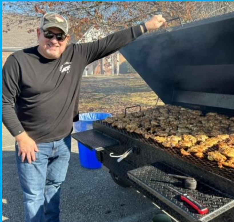
Feeding people in Rocky Mount