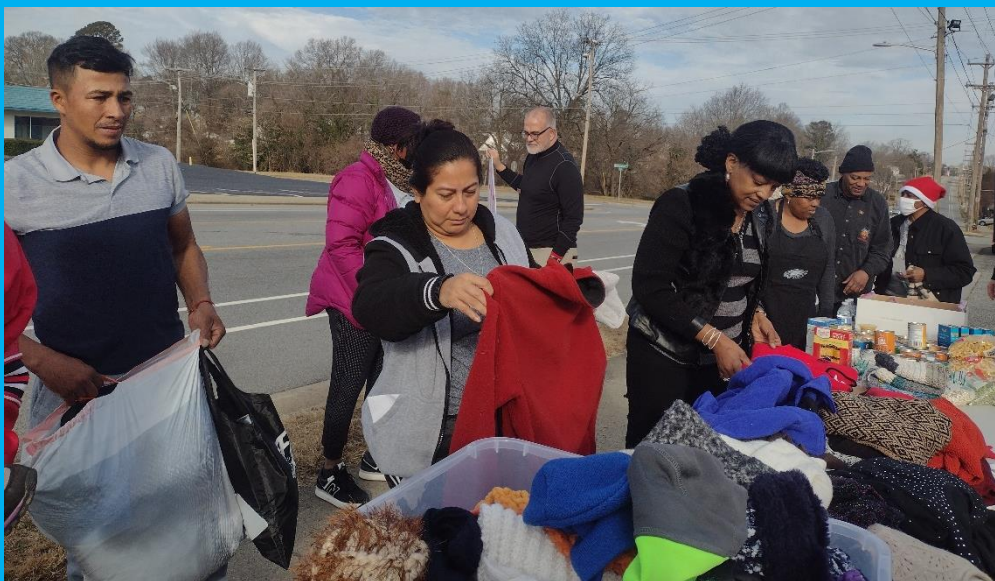
People enjoying free shopping