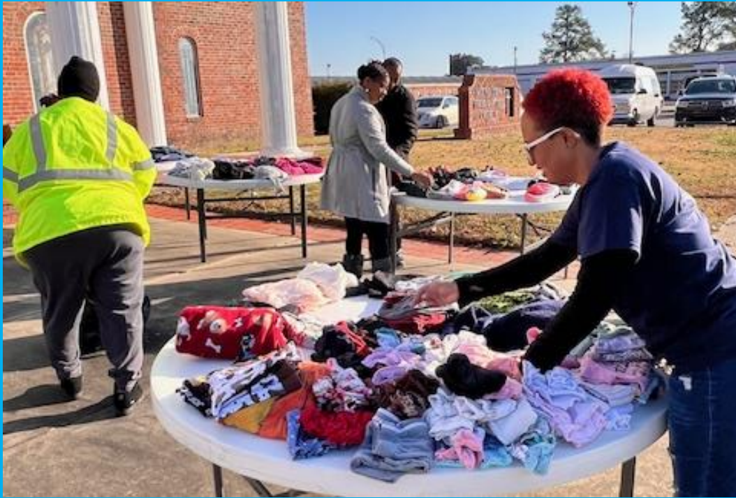
This event was held at Mount Zion Baptist Church in Rocky Mount.