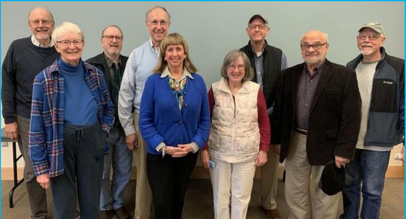
The Senior Democrats of Durham County held a lively November 13 th meeting at Shannon Road Library. Four new members joined that day.