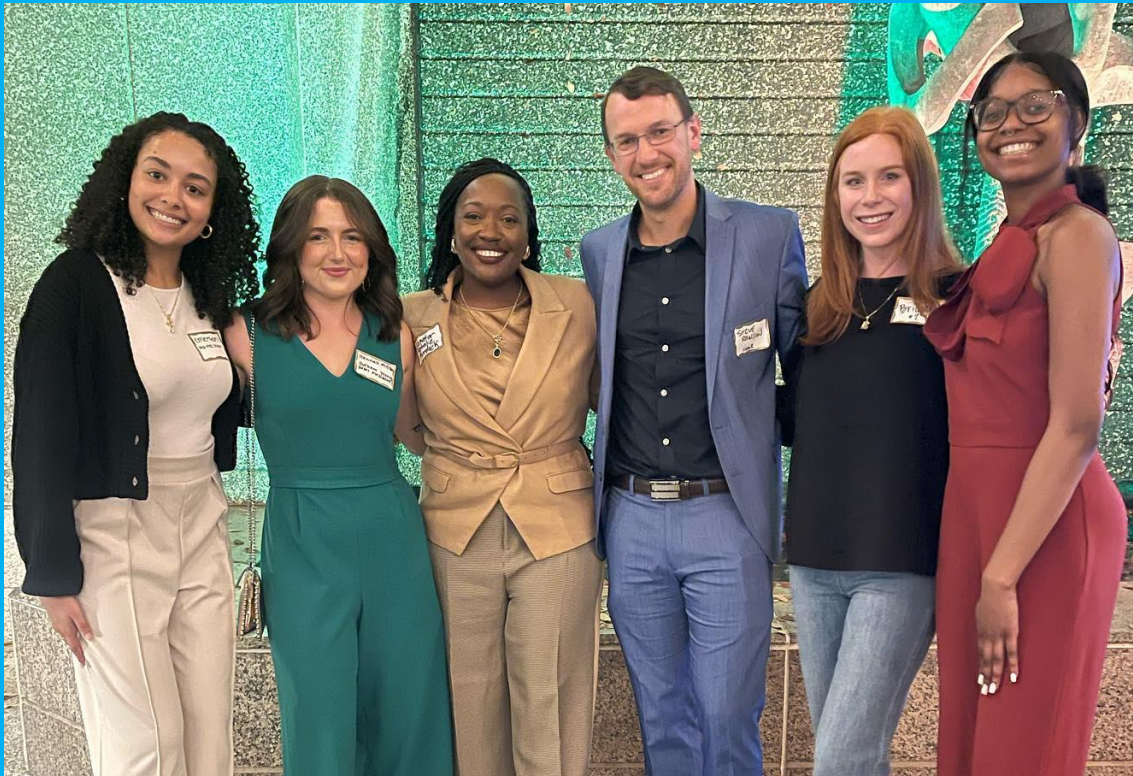
More of the celebrating Durham County Democrats!