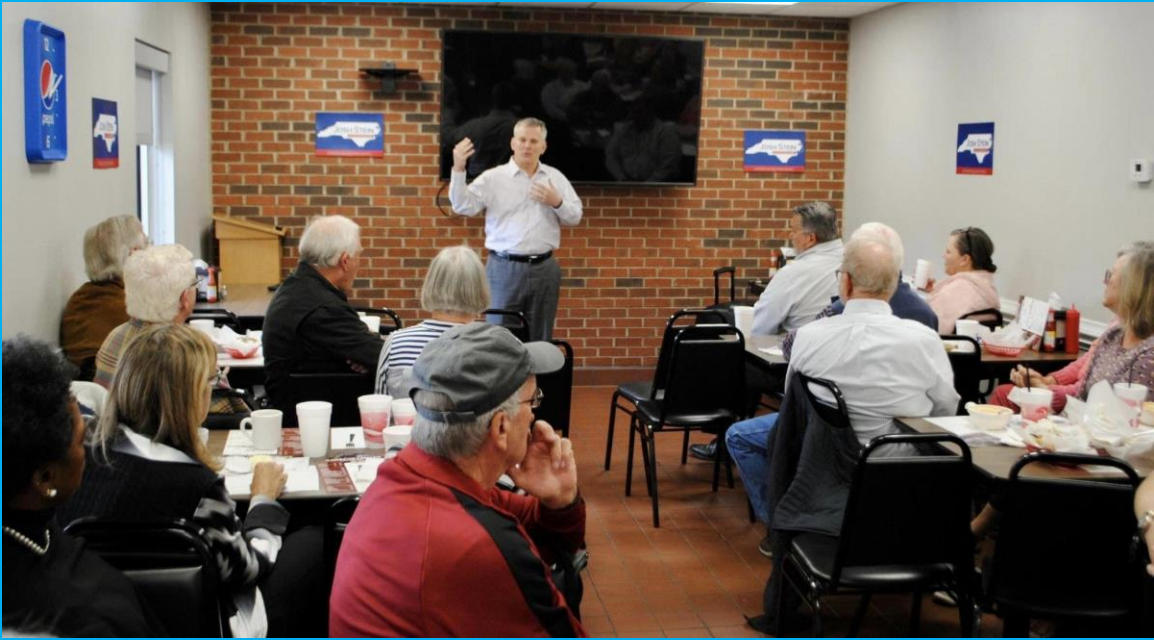
Josh Stein campaigning in Lexington on November 20th