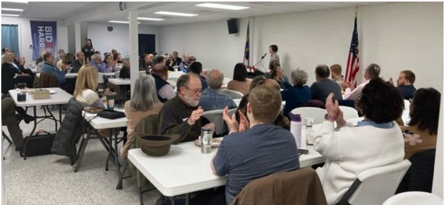
Buncombe Democrats have a large County Headquarters in Asheville where they can hold all their meetings and breakfasts.