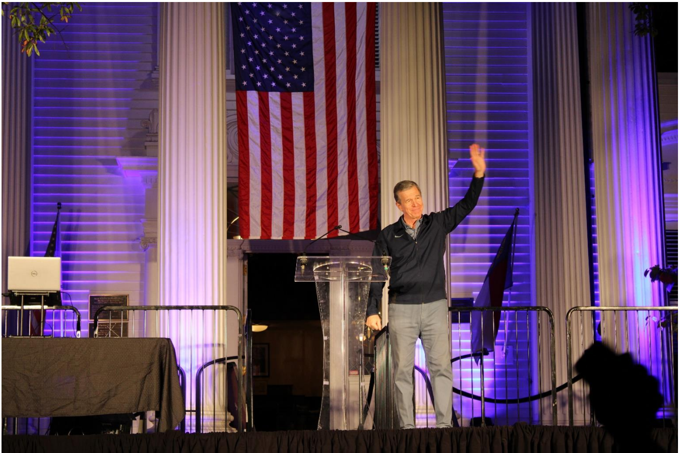
Governor Cooper addressed the block party.