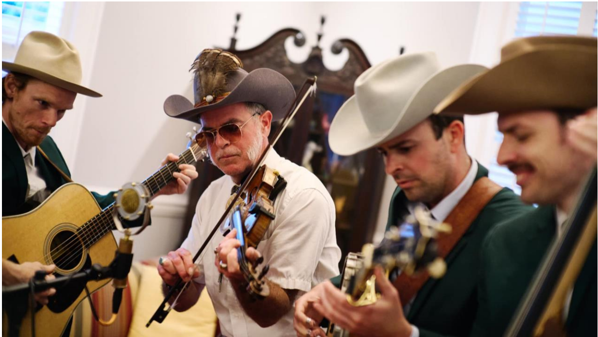
The “Carolina Cutups” from Orange County entertained the Democrats.