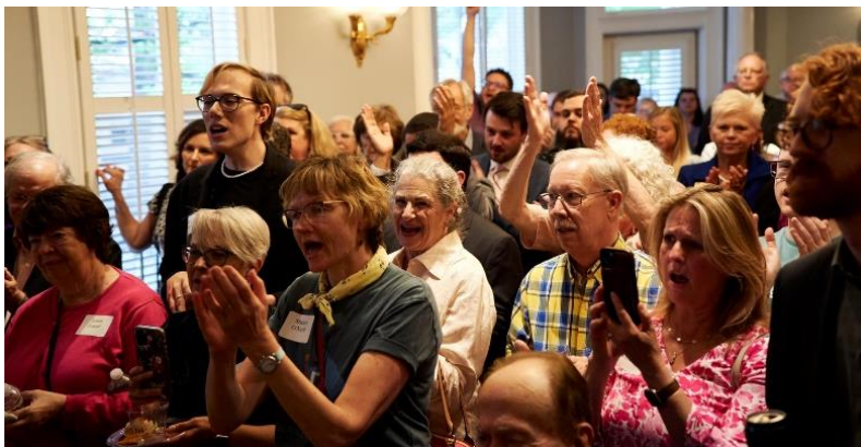
Left: A small part of the cheering crowd!