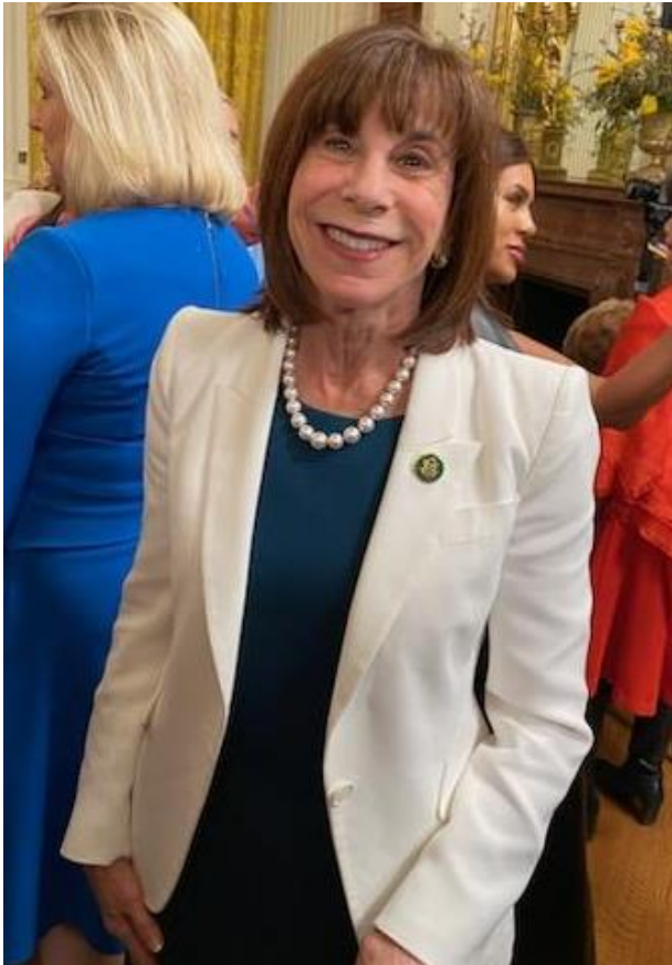
NC Congresswoman Kathy Manning