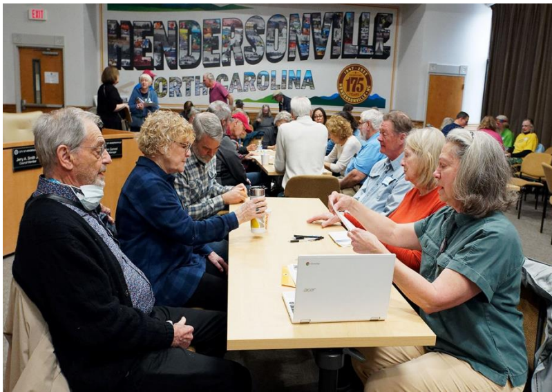
Precinct members electing their officers

Henderson County Democrats enjoy all their activities!