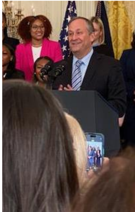
Second Gentleman Doug Emhoff