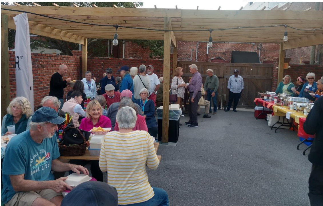
Part of the large Carteret crowd