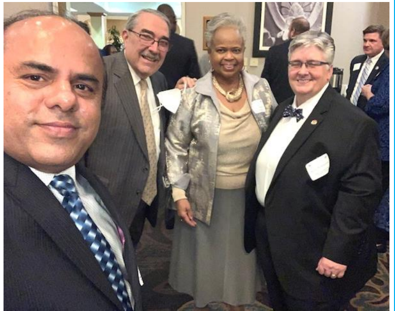
Congresswoman Kathy Manning addressed the Guilford Democrats