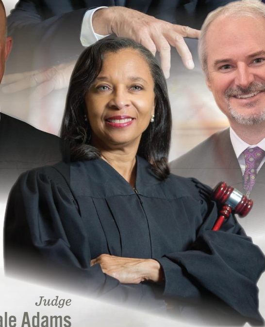
Judge Gale Adams for Court of Appeals Seat 10