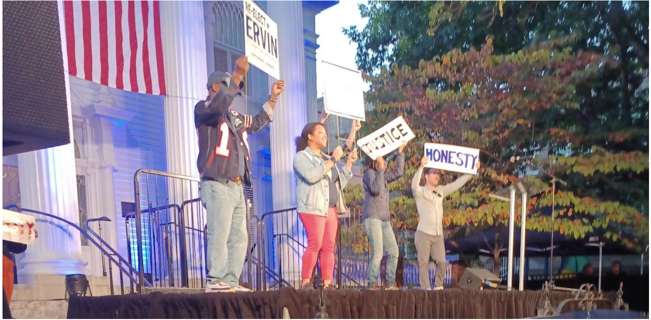
Dancers promoting our Democratic Judges!