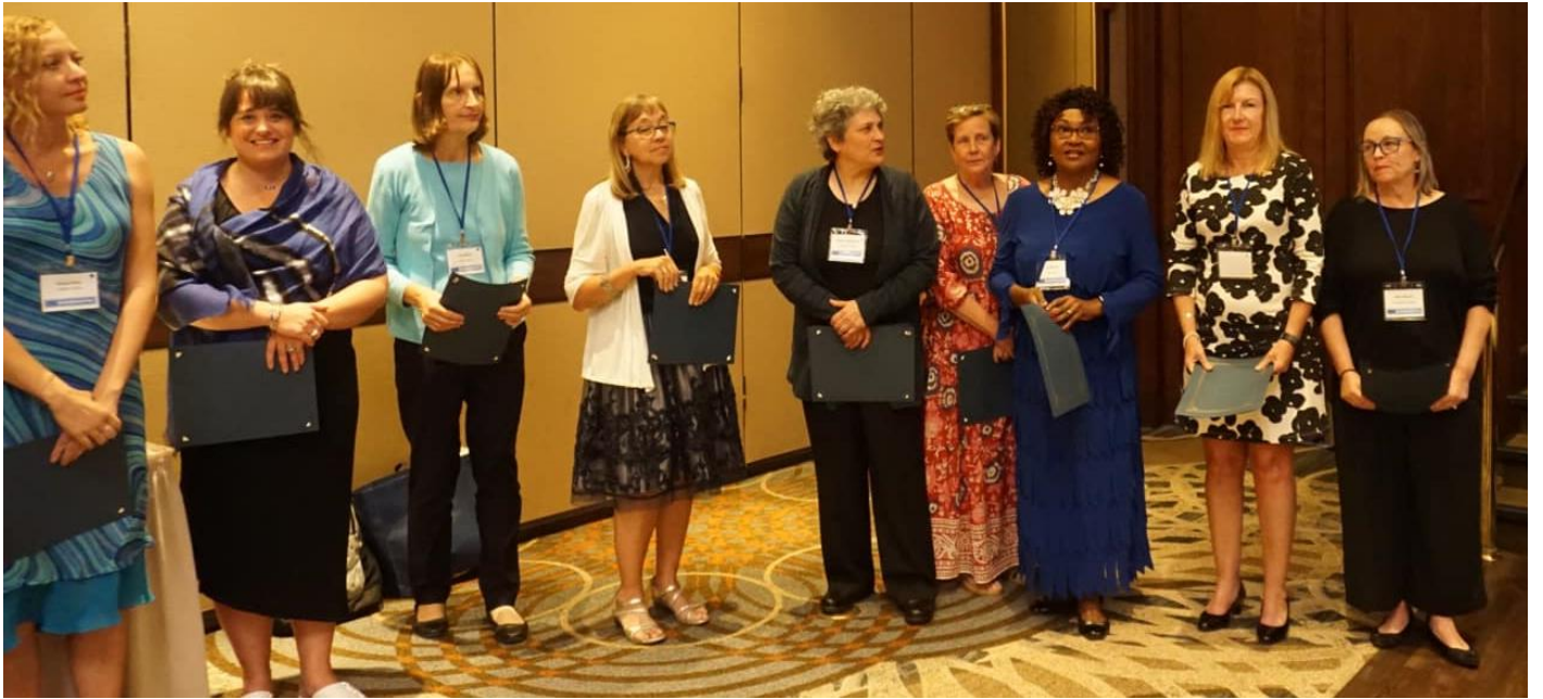
Some of the STAR AWARD recipients at the State Democratic Women's Convention at the Koury Convention Center in Greensboro