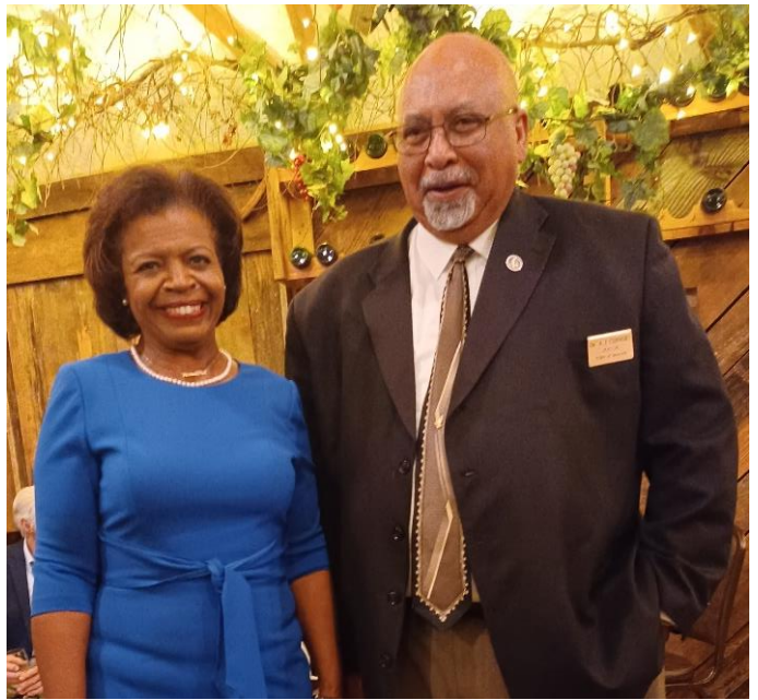
Cheri with Warsaw Mayor A. J. Conyers