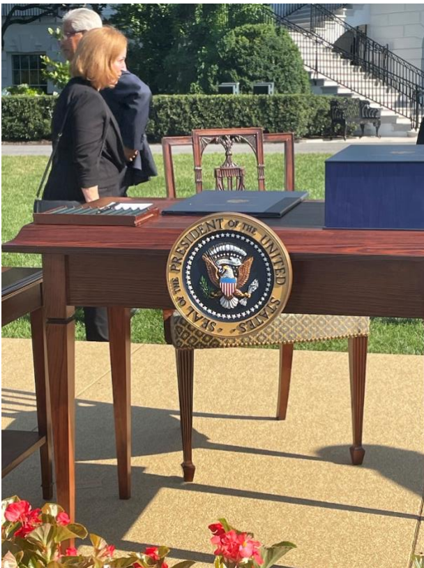
The act was signed on this desk.