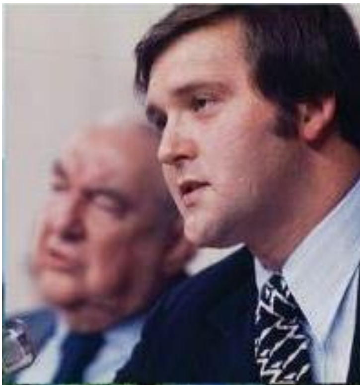
Rufus with Senator Sam Ervin during Watergate