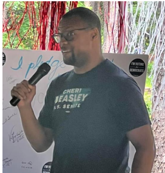
Cheri Beasley's son