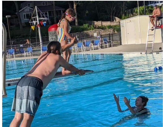
More pictures from the Jackson County Pool Party