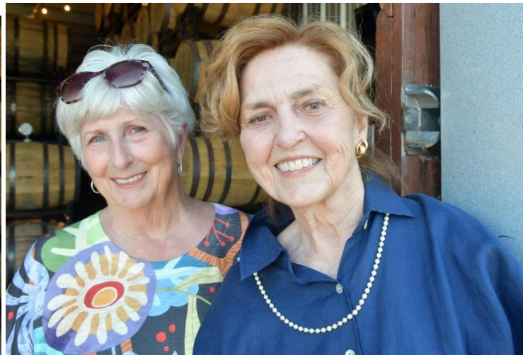
More pictures from the sold-out Unity Dinner