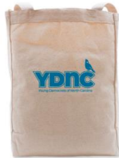
NEW LOGO ON A BAG