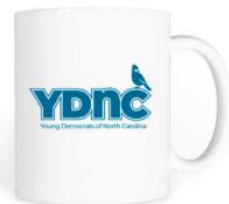
NEW LOGO ON A MUG