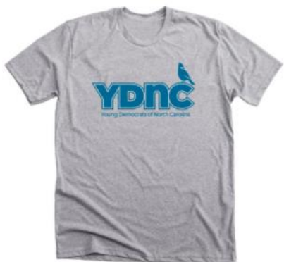
Premium Unisex Tee