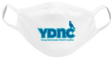
NEW LOGO ON A MASK

A MAJOR ANNOUNCEMENT! A NEW YD STORE WITH NEW MERCHANDISE FOR ALL AGES! CLICK HERE TO VIEW EXCITING MERCH https://www.bonfire.com/store/ydnc/