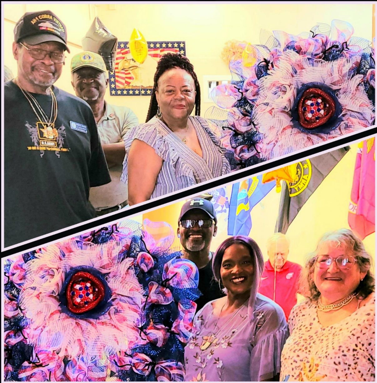
More Pictures from the Wayne County Veterans and Military Families Event