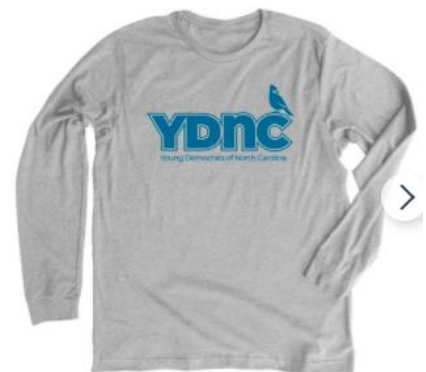
Premium Long Sleeve Tee