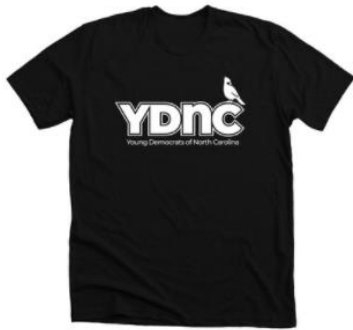
Premium Unisex Tee