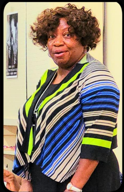
VETERANS AT GOLDSBORO EVENT!