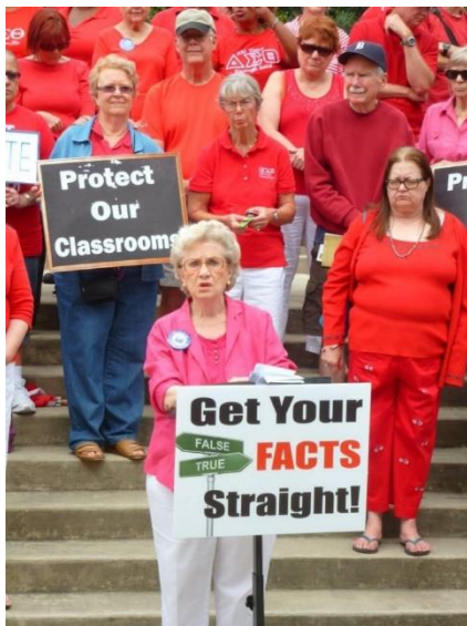
Dot speaking at an Education Rally