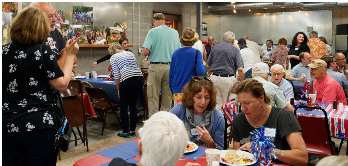
A big turnout of Democrats who had a lot to catch up on!