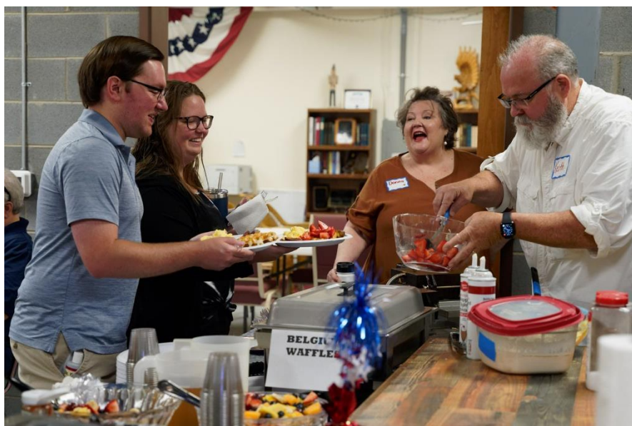
Henderson Democrats eagerly awaiting their waffles