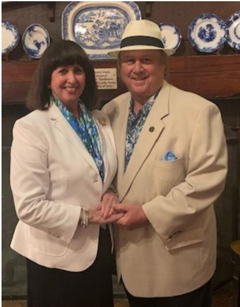
This picture was made on June 1, 2021, the day of their 36 th Anniversary. They are shown before eating dinner at the Angus Barn that night. The Angus Barn was the location of their Rehearsal Dinner years ago.