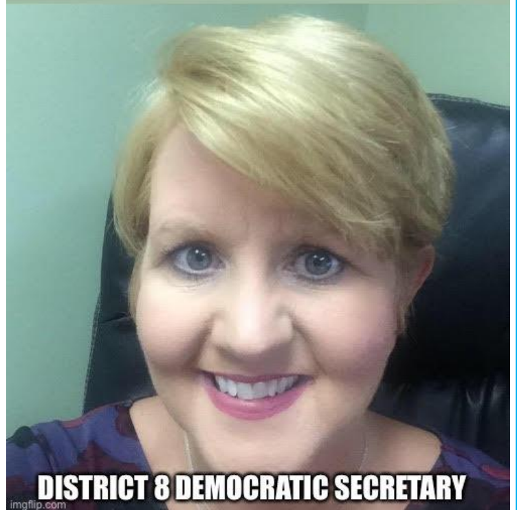
DISTRICT 8 DEMOCRATIC SECRETARY