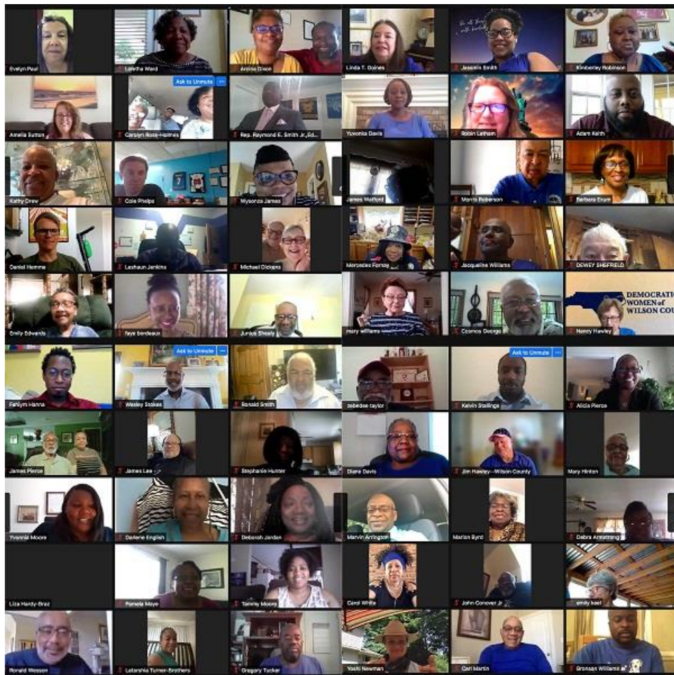
SEN. DAVIS SENT THIS COLLAGE FROM 1 ST DISTRICT CONVENTION!