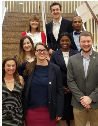
The Young Democrats of North Carolina Executive Board 2019-2020.