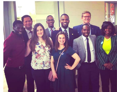
The Young Democrats of North Carolina backstage at the Biden For President Community Event held at Hillside High School in Durham, NC on Oct. 27th, 2019.