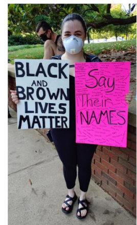
Marching in solidarity with Black Lives Matter Winston-Salem at the June 3rd public protest in downtown Winston-Salem in response to the murders of George Floyd and Breonna Taylor by law enforcement.