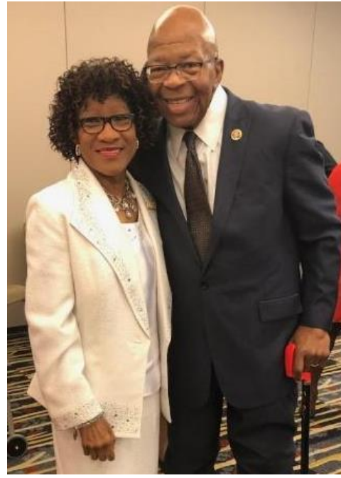
At Women's March, January, 2017