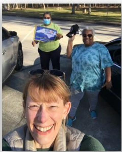
Supported Vance County Dems & AAPI's Inauguration Flag program.