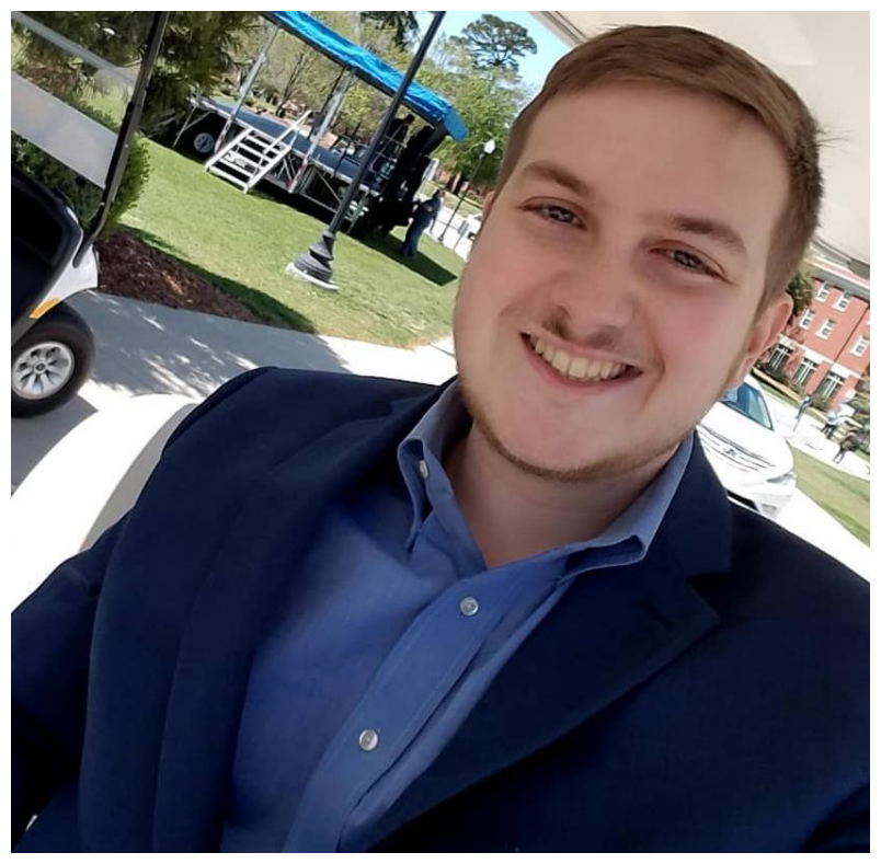
NCDP RURAL CAUCUS ORGANIZED!

On January 27<sup>th</sup> about 100 Democrats joined together by Zoom to organize the Rural Caucus of the NCDP. It took two Zoom calls which lasted more than three and a half hours, but they elected a strong group of Acting Officers.