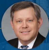
STATE SENATOR MIKE WOODARD