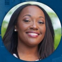
STATE SENATOR NATALIE MURDOCK