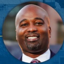
STATE REPRESENTATIVE ZACK HAWKINS