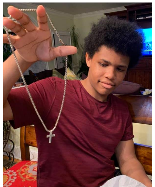
Then he went inside to open all the gifts his guests had delivered to him.