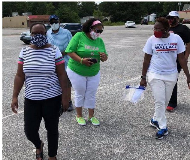
The lady in the green is Superior Court Judge-Elect Tiffany Powers

CYNTHIA'S WEBSITE: WWW.CYNTHIAWALLACE.COM