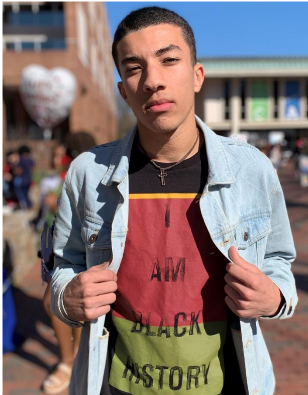
Celebrating the 14 th day of Black History Month in the center of the UNC-CH campus alongside members of UNC's Black Student Movement. Greear says: "Truly, I Am Black History!"