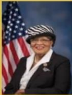
Congresswoman Alma Adams