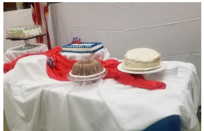
Every cake was especially created for this Duplin County event which has been held in every election year since 1978! It is one of the most unique events in the entire state!