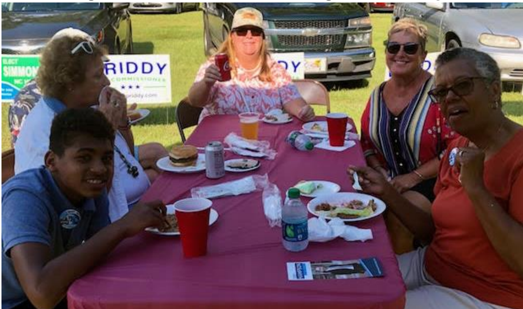
Happy Brunswick Democrats