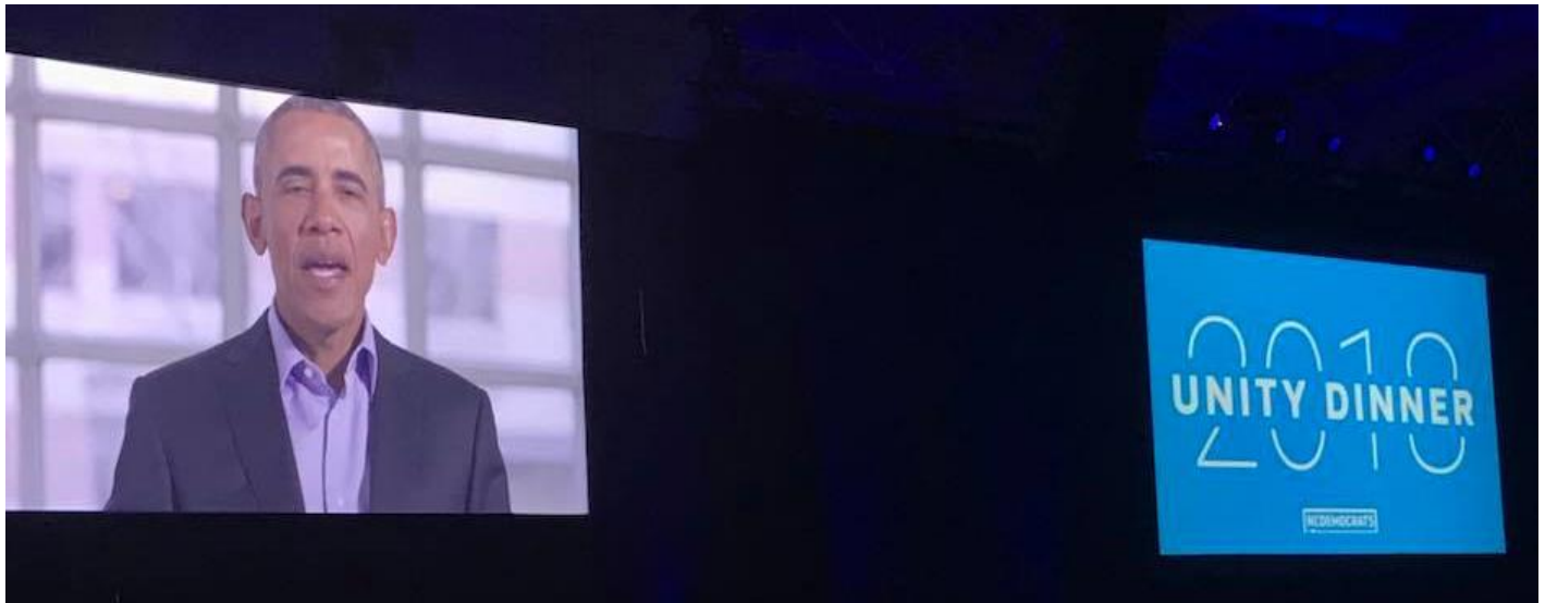
President Obama was one of many Democrats who gave video tributes to Kay Hagan.