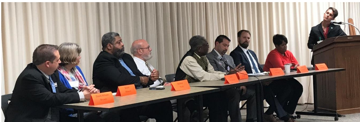
Gaston County's lineup of outstanding candidates