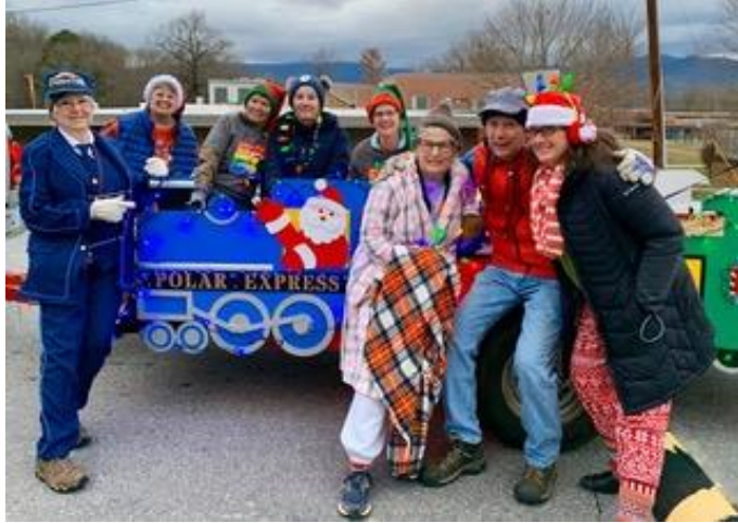
Tri-County Democratic Women participated in two Christmas Parades! They were stars of the Murphy Parade in Cherokee County and the Hayesville Parade in Clay County.