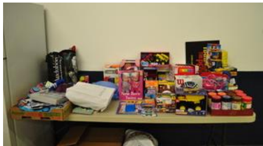
The picture at bottom right shows only one of the tables of donations that the goodhearted Brunswick Democrats brought.