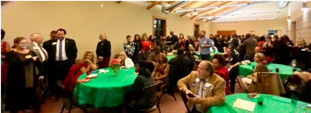
Part of the holiday crowd