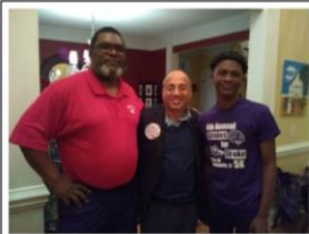
TJ is only 13 years old concerned about racial bias.