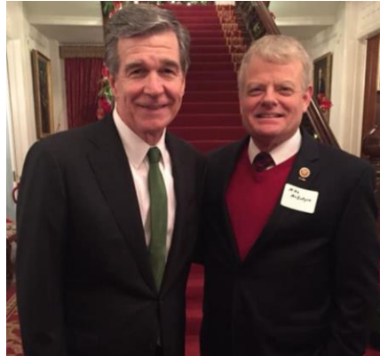
Congressman Mike McIntyre