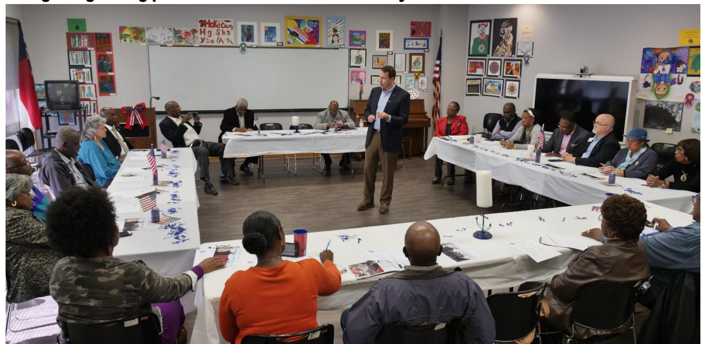
Cal during a roundtable discussion in Raeford in Hoke County

Above: Cal at the Union Headquarters of the United Commercial & Food Workers near the vast hog slaughtering plant at Tar Heel in Bladen County.