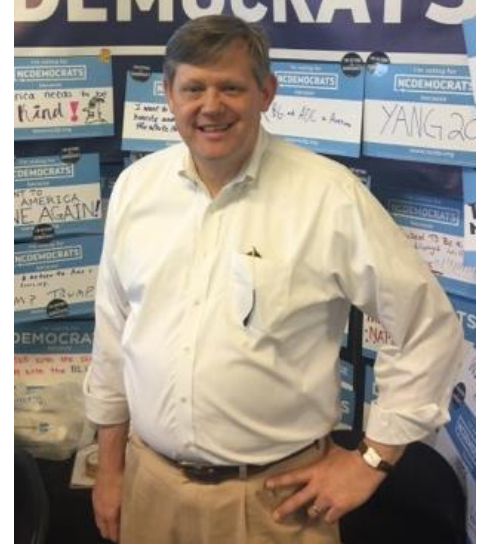
State Senator Mike Woodard of Durham