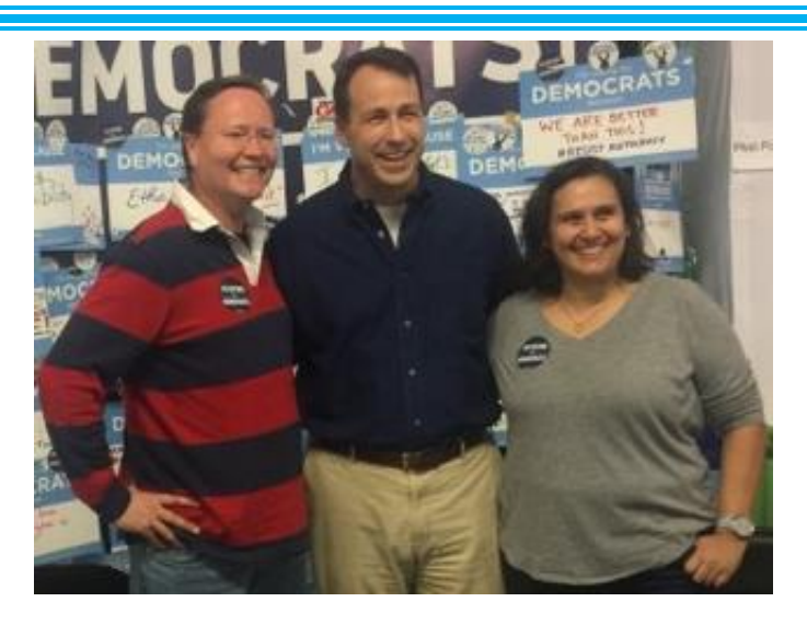
US Senate candidate Cal Cunningham