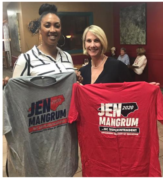
More fun: Jen's campaign held a "TEACHERS LOUNGE" fundraiser at Zweli's in Durham.