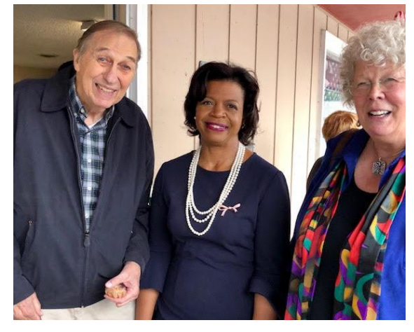
Chief Justice Beasley was uplifted by the cheerful Democrats of Haywood County!