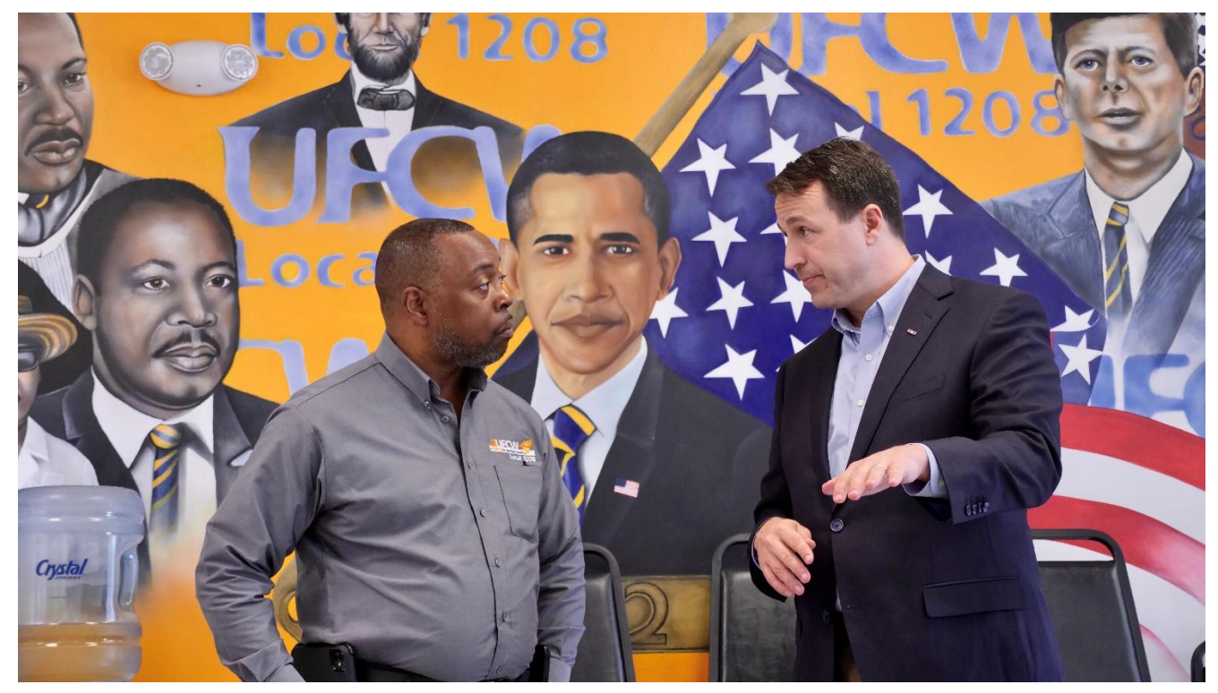
CAL CUNNINGHAM – A CANDIDATE IN CONSTANT MOTION!

US Senate candidate Cal Cunningham is busily traveling all over the state to deliver his message to as many voters as possible.