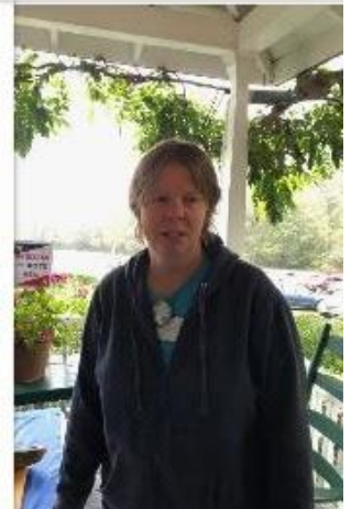
FAIRVIEW/REYNOLDS PRECINCT CLUSTER – BUNCOMBE COUNTY! Entertaining music, delicious food, and inspiring talks at historic Sherrill's Inn