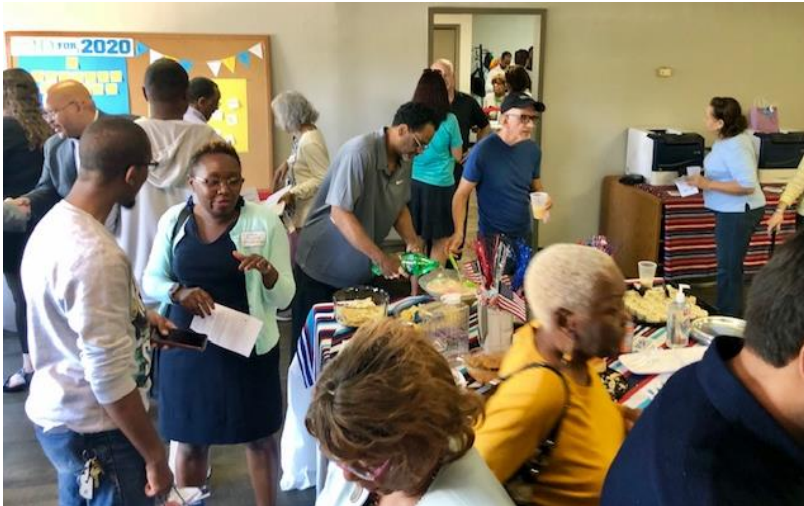
Lots of Mecklenburg Dems enjoyed the Grand Opening.