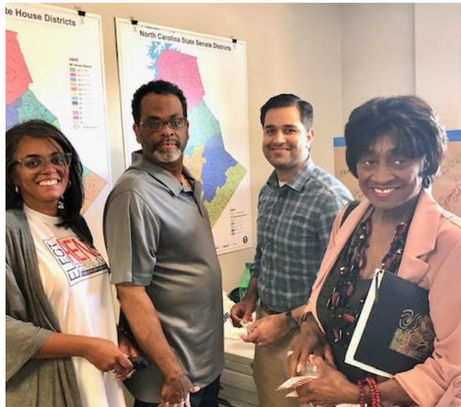
Senator Mohammed gave a detailed presentation on how the new redistricting will affect Mecklenburg County.