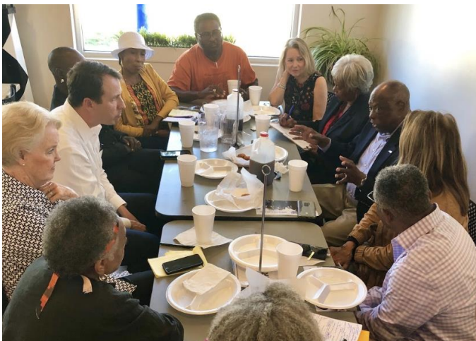
Listening to voters at Forsyth Seafood