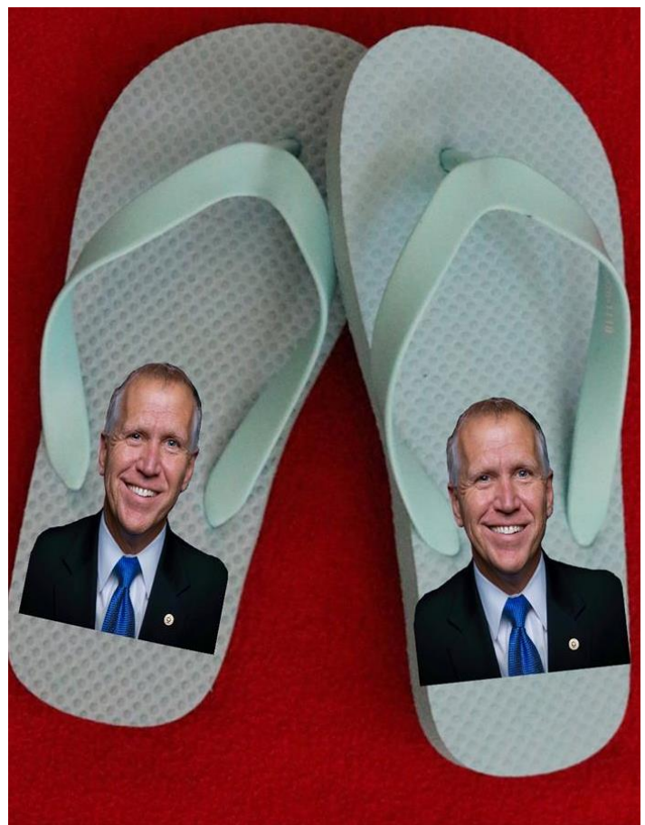
Democrats enjoyed seeing this pair of "empty" Thom Tillis flip flops.