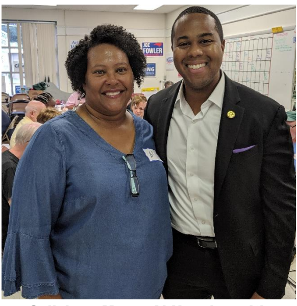
Salisbury Mayor Al Heggins with Lt. Governor Candidate Chaz Beasley