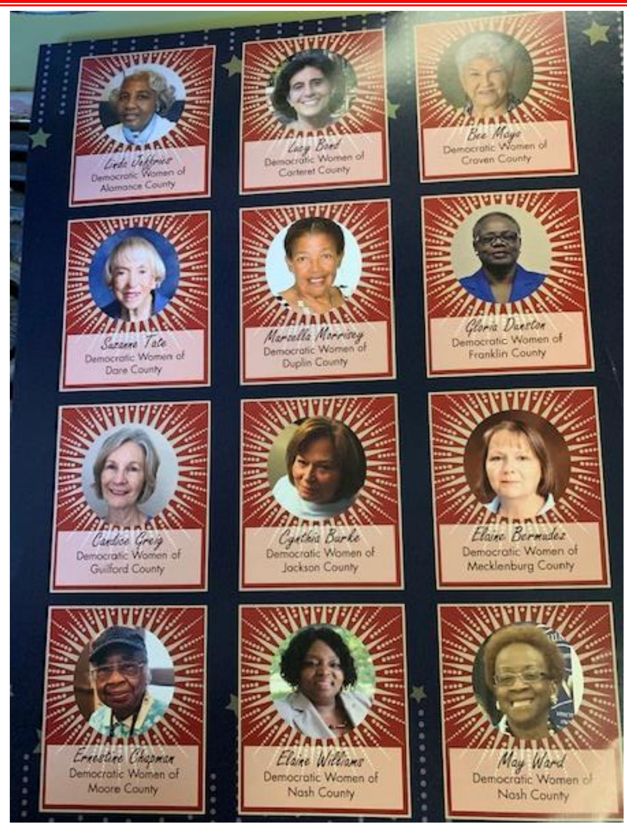
THIS PAGE FROM THE DW CONVENTION PROGRAM HONORS TWELVE STARS!