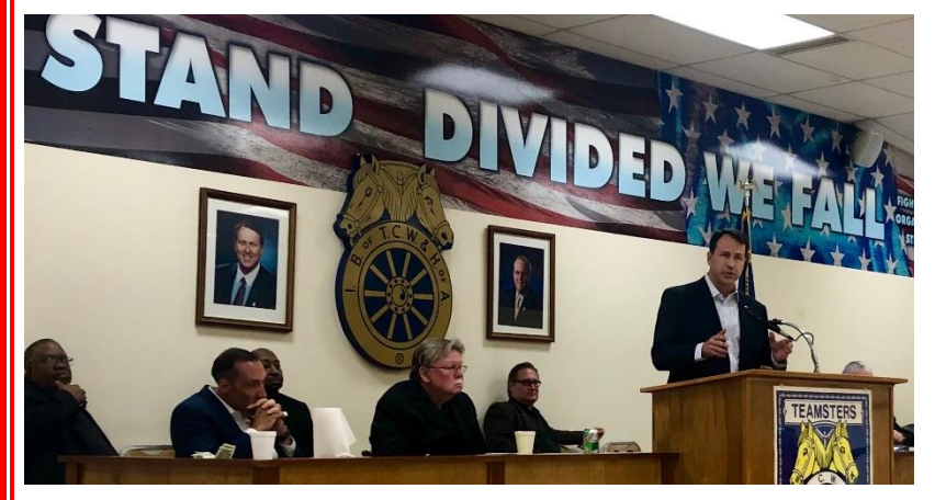
Cal addressing members of the Teamsters Brotherhood