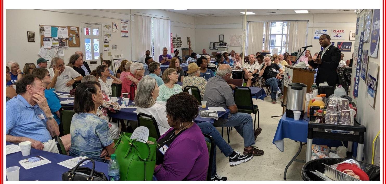
This picture shows many of the Democrats who turned out for the September Breakfast.

North Carolina Democrats can learn more about the exciting Rowan County Democrats at this link: