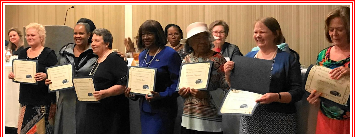
These outstanding Democratic Women were honored as STARS at the State DW's STARS BANQUET. Everyone of them is a long time dedicated Democrat!