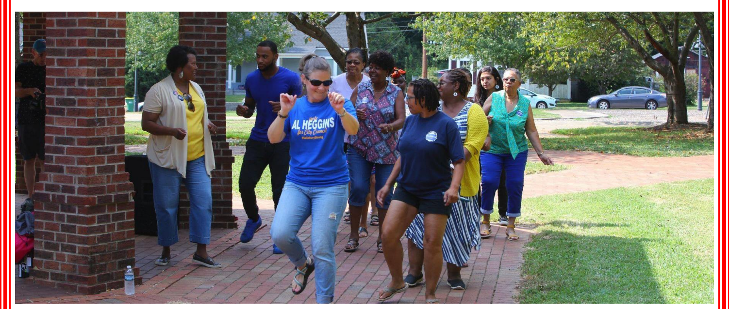
This group of Heggins supporters staged a line dance which went on for a long time.