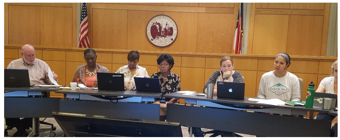
This September 7<sup>th</sup> session was held at the Pinehurst Village Hall in Pinehurst.