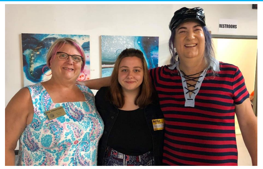
YOUNG DEMOCRATS' LBGTQ CAUCUS EVENT!

On August 10<sup>th</sup> the LBGTQ Caucus of the Young Democrats of North Carolina held a fundraiser with the Charlotte chapter of the National Organization of Women. They raised money to buy transportation passes for immigrants in the Charlotte area.