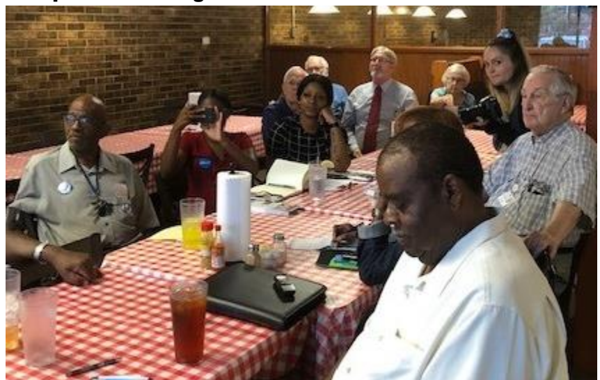
Part of the crowd in Laurinburg

Question: Have you invited the NCDP Listening Tour to come to your county yet?