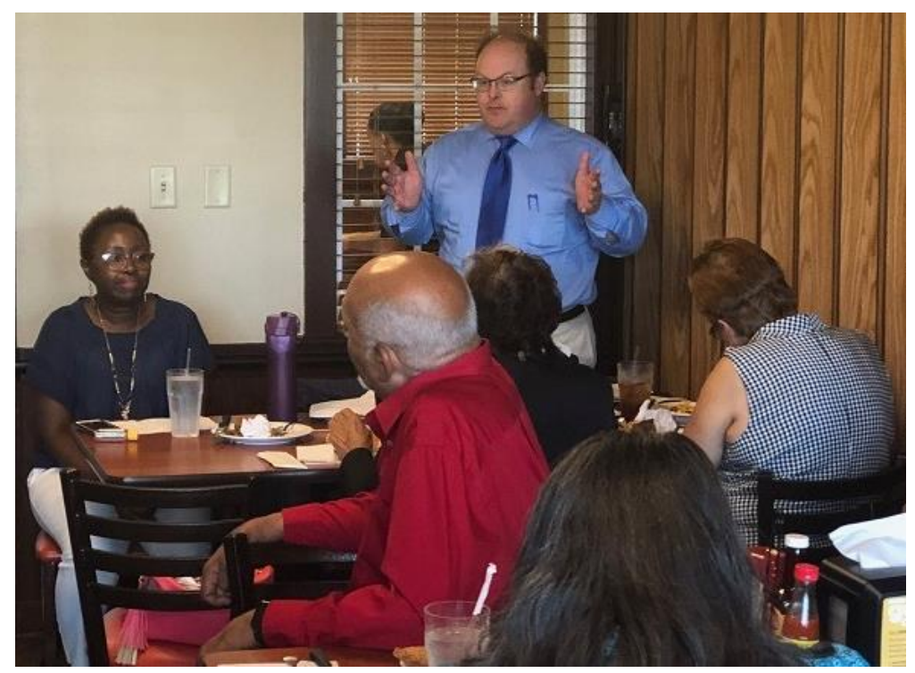
From 11:30AM until 1:00PM the touring Democrats met with Robeson County Democrats at the Golden Corral in Lumberton.