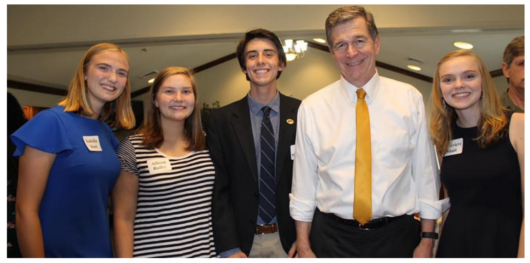
LARGE LINCOLN COUNTY TURNOUT FOR GOVERNOR COOPER!

On August 13th lots of Lincoln County citizens gathered at the Lincoln Country Club in Lincolnton for a major fundraising event for Governor Roy Cooper's re-election. In the picture above, Governor Cooper is happily posing the some of the county's Teen Dems.