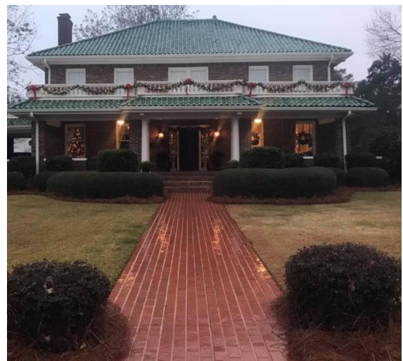
The site of the Bar dinner