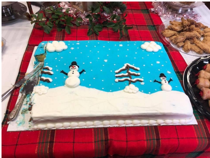
Bar event cake