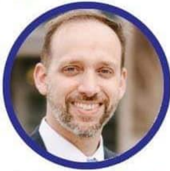
TOBY HAMPSON NC Court of Appeals Seat 2