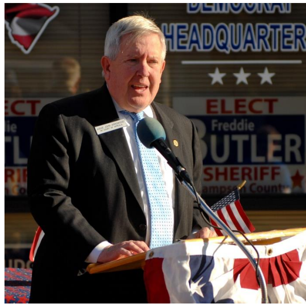
Judge John Arrowood for NC Court of Appeals