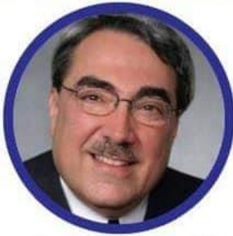
G.K. BUTTERFIELD U.S. Congress North Carolina Dist 1