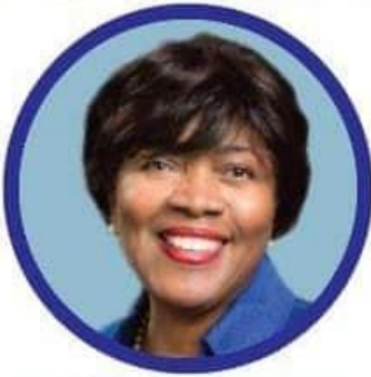
LINDA COLEMAN U.S. Congress North Carolina Dist 2