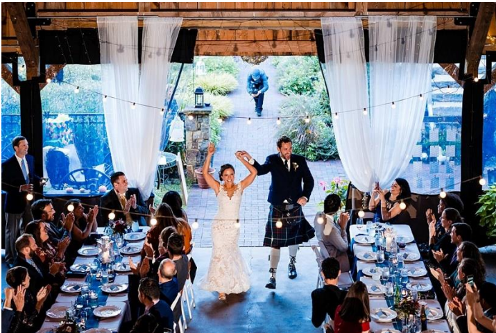
The happy couple as they entered the wedding banquet.