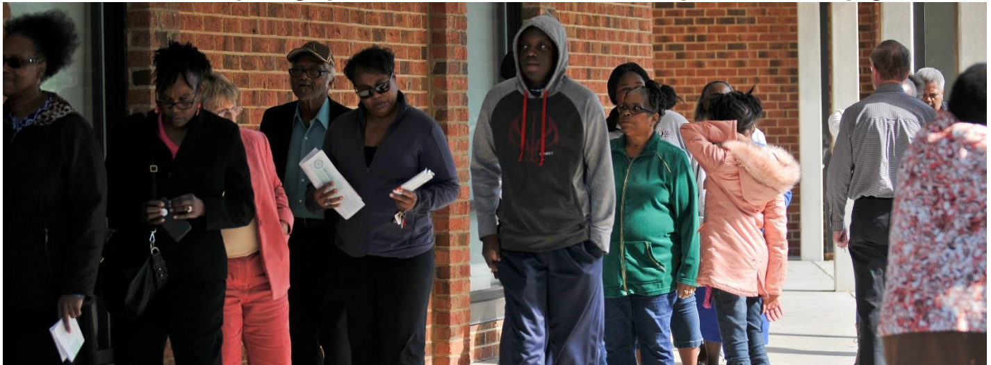
Wayne County voters eagerly lined up to make their voices heard!