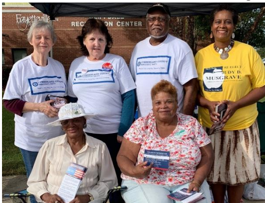
Democratic EV staff at Cliffdale site