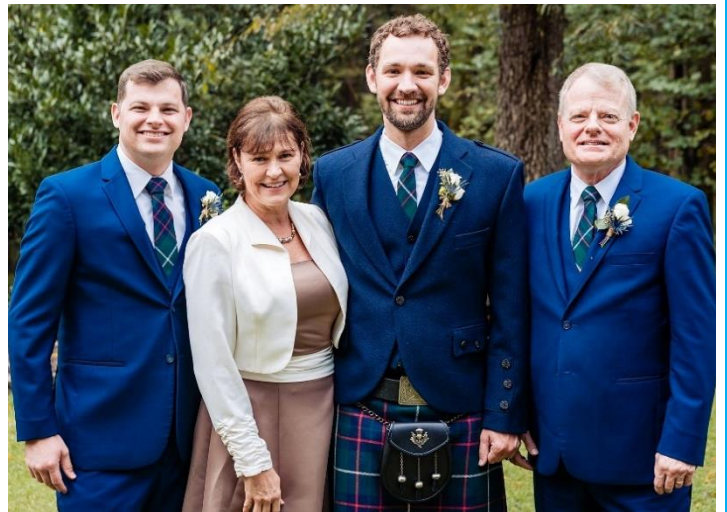
All the men in the wedding wore a brilliant shade of Democratic blue.