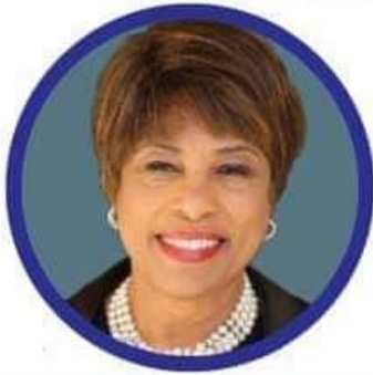
BRENDA LAWRENCE U.S. Congress Michigan Dist 14