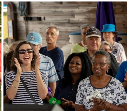
Part of the cheering crowd