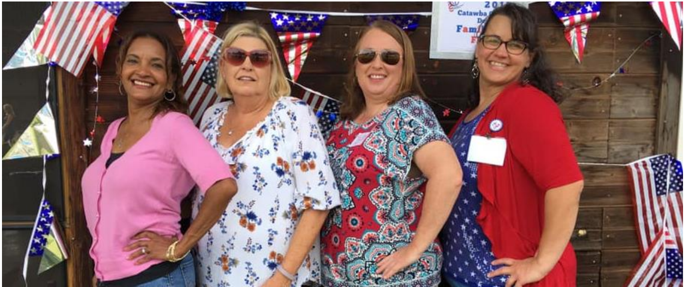
HAPPY CATAWBA COUNTY DEMOCRATS!