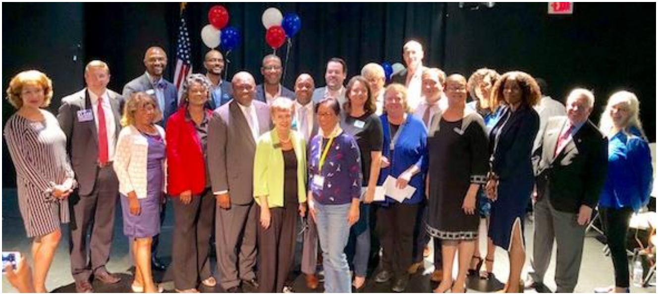
Beautiful Democrats! Local and statewide Democratic candidates at the Kickoff Rally.