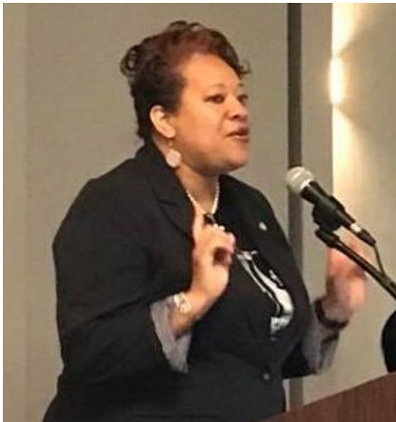
Popular State Senator Erica Smith gave a motivational talk to the Democratic Women.