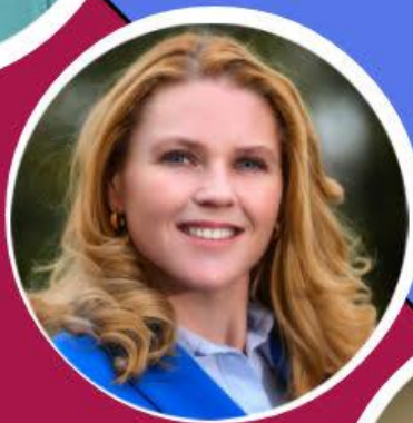
CAROLINE WALKER NC State Senate Dist. 35