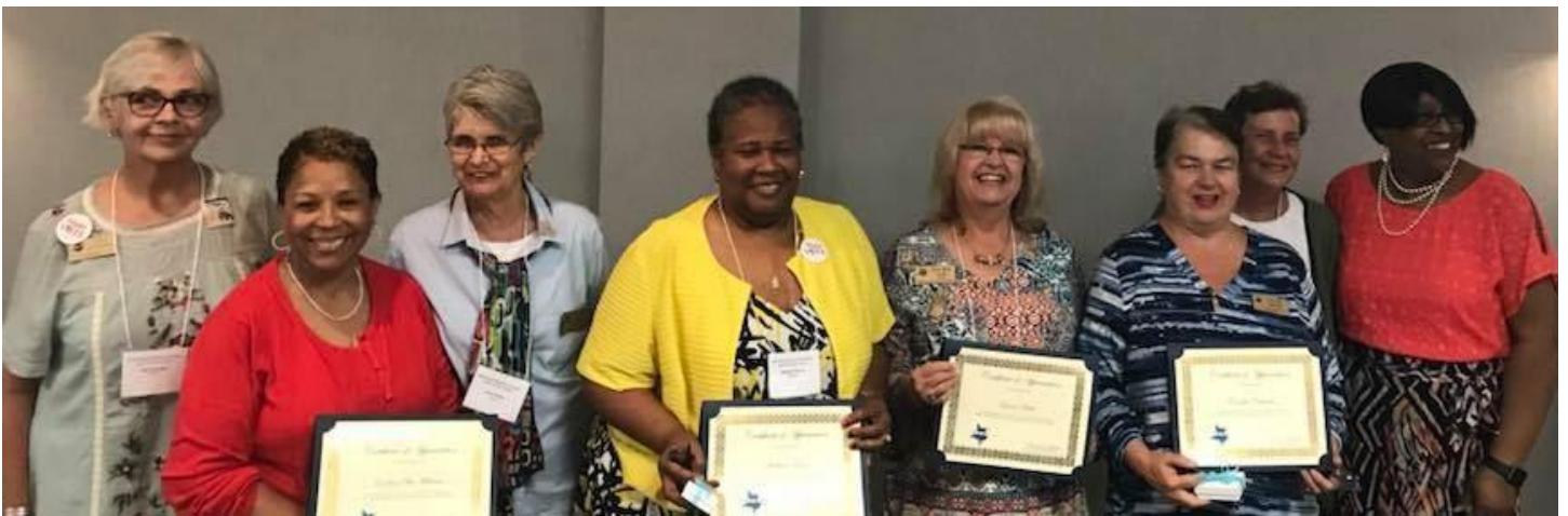
The State DW Convention happily paid tribute to their former Presidents.