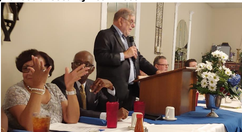
Alamance County celebration in Burlington