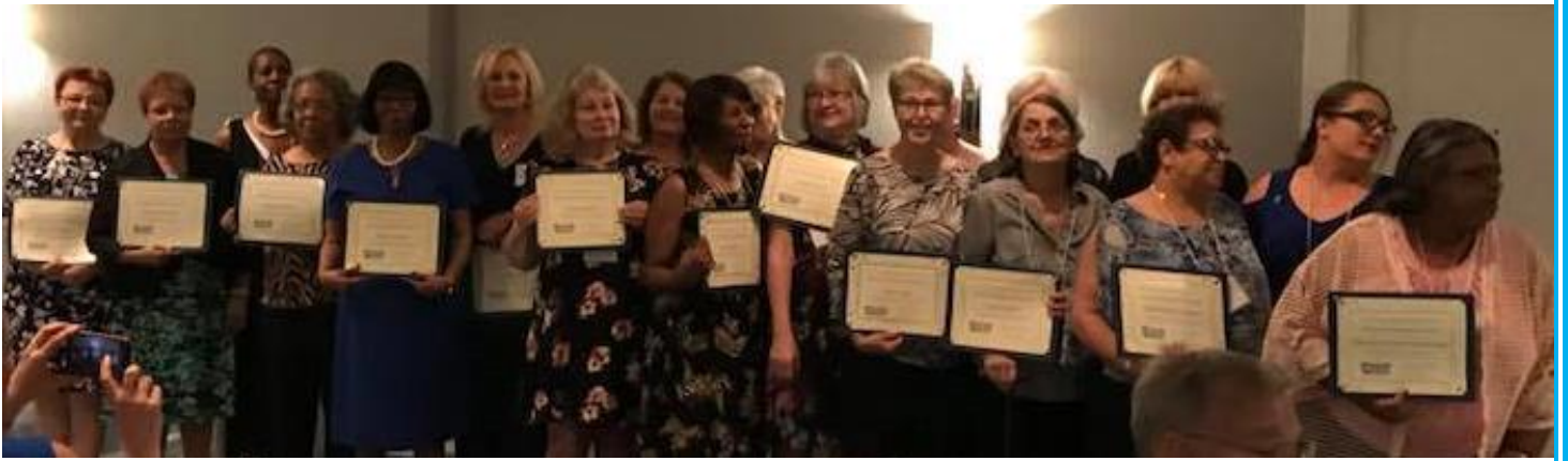
THE STARS – These outstanding DW leaders were saluted during the presentation of the DEMOCRATIC WOMEN STAR AWARDS!