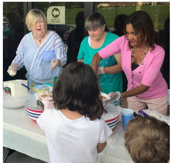
Face painting and ice cream dipping