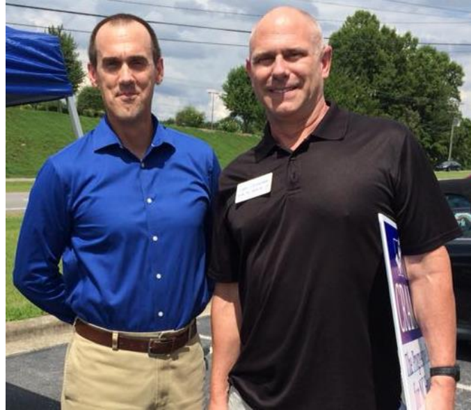
The Cranfords: Scott for Judge, Greg for State Rep