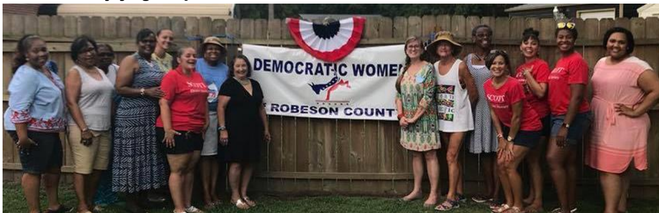
Happy Democratic Women of Robeson County.