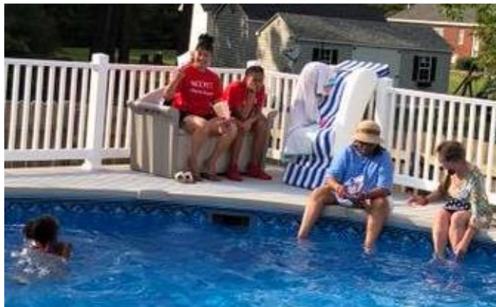
Enjoying the pool!