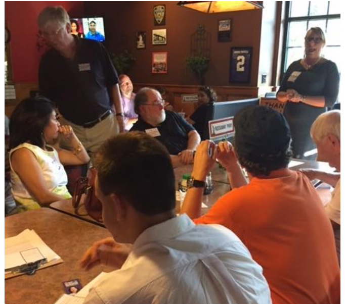
Part of the Democrats who filled Brooklyn Pizza for the event.