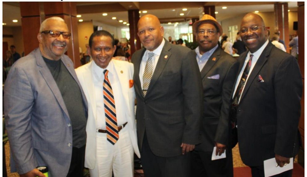
Five enthusiastic Democratic men at the Sanford Hunt Frye Celebration!