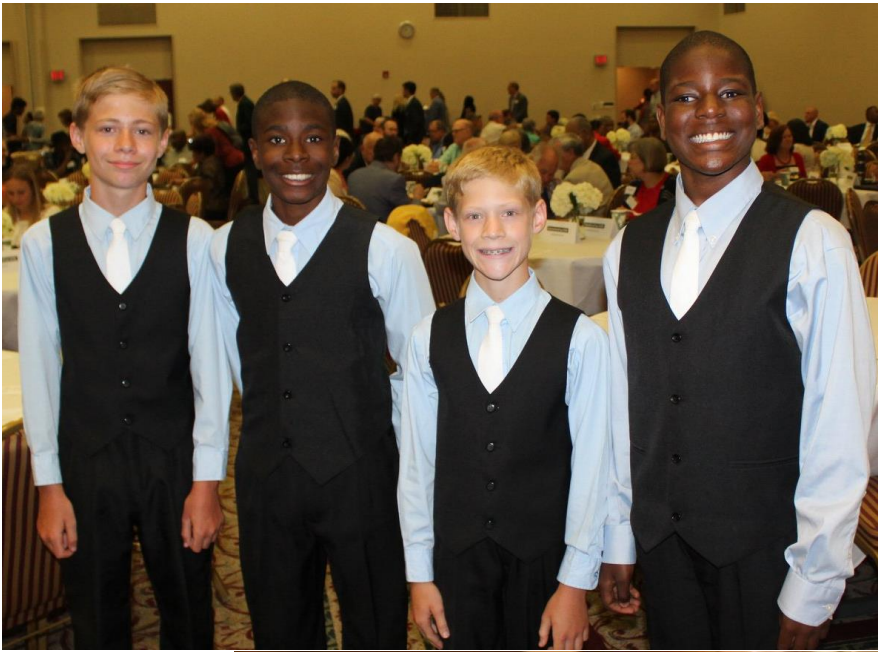
The vocal renditions of THE HOWARD BROTHERS from Southport made the Sanford Hunt Frye Celebration unforgettable!