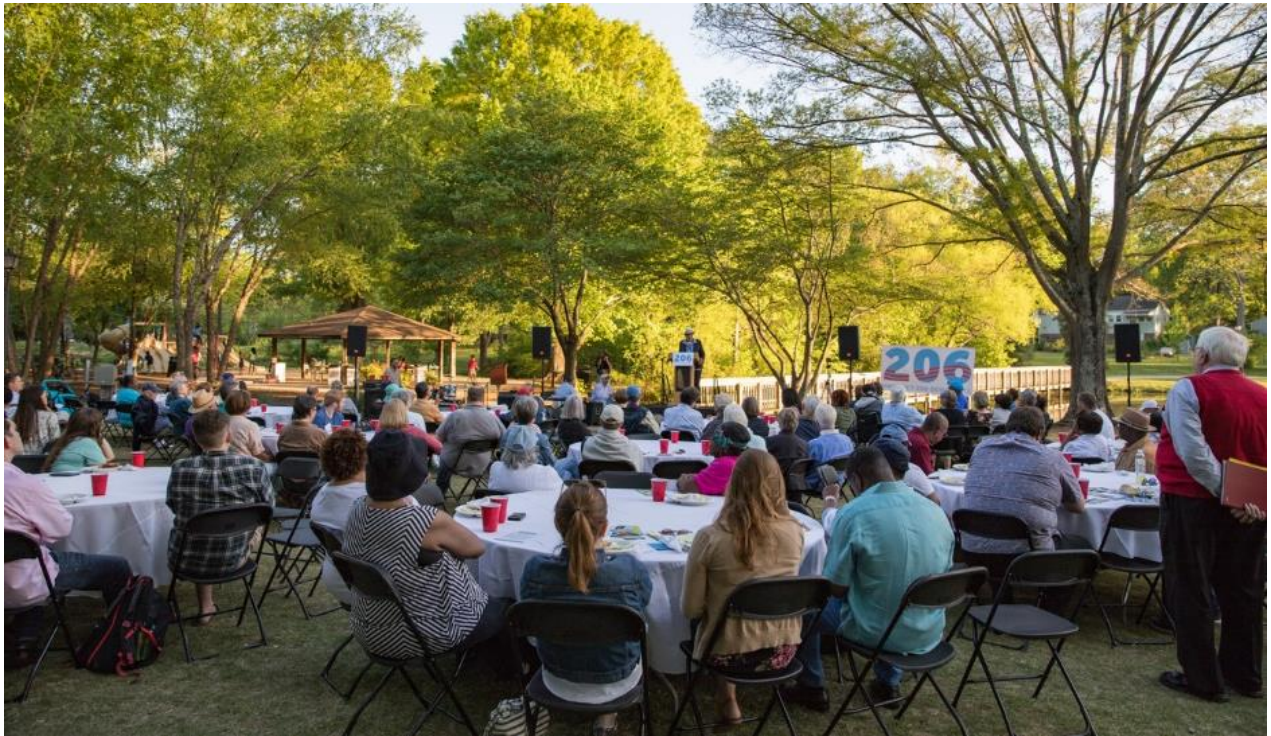
What a beautiful scene! Precinct 206 Democrats listening to Congresswoman Adams speaking on a cheerful, sunny day!