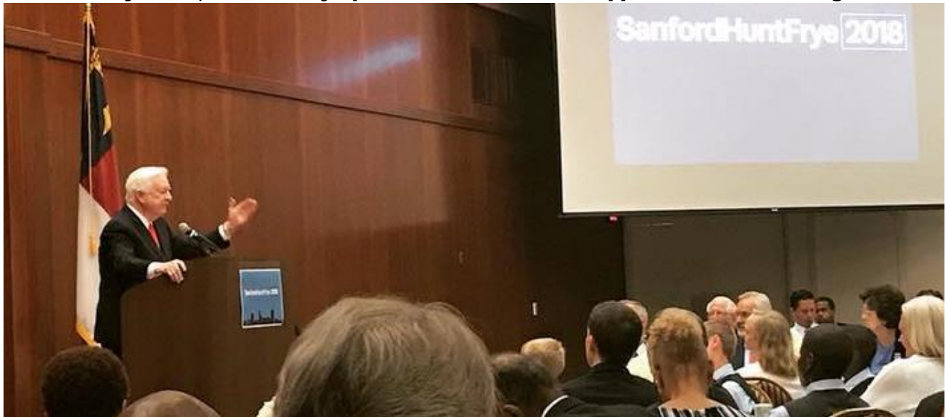
Governor Hunt: Leading the Democratic charge!