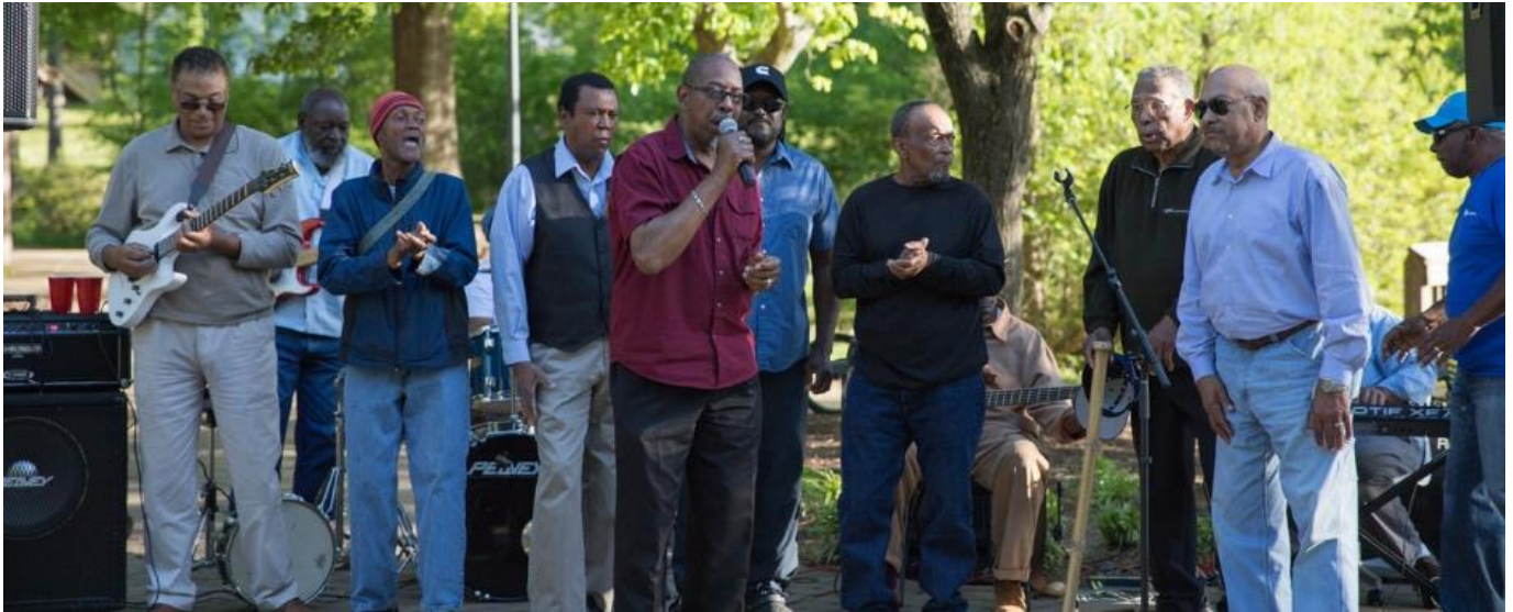
Live music was provided by bands and choirs from local churches!