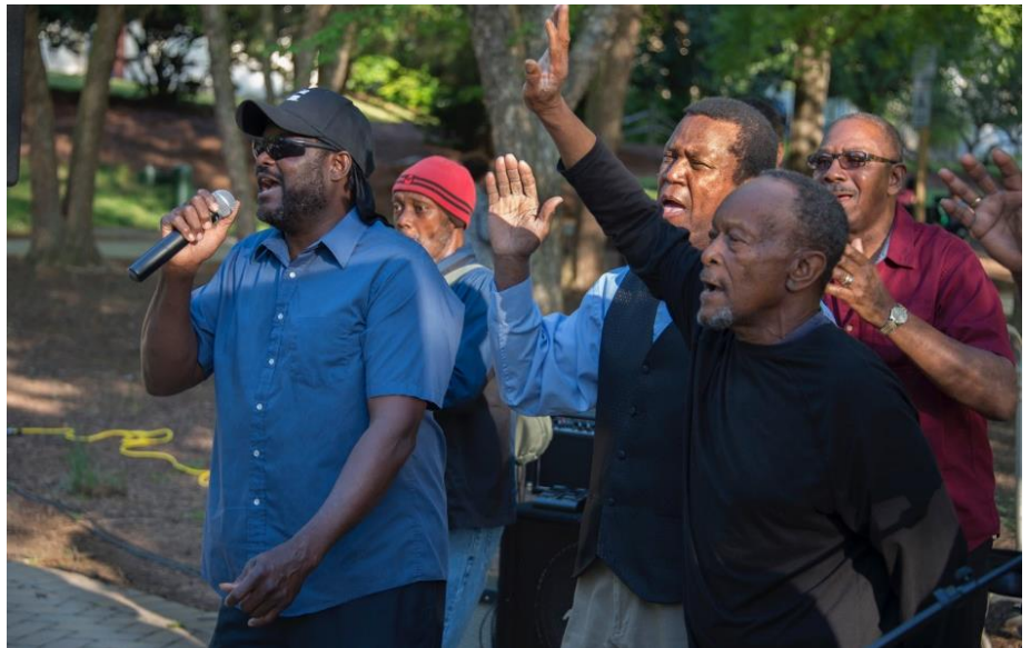
Singing victory songs!