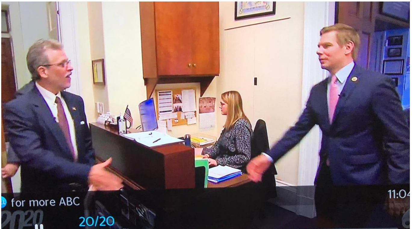
In this picture Olivia is busy at work as Congressman Swalwell greets the cast of ABC's 20/20 show as they arrived for a televised interview.