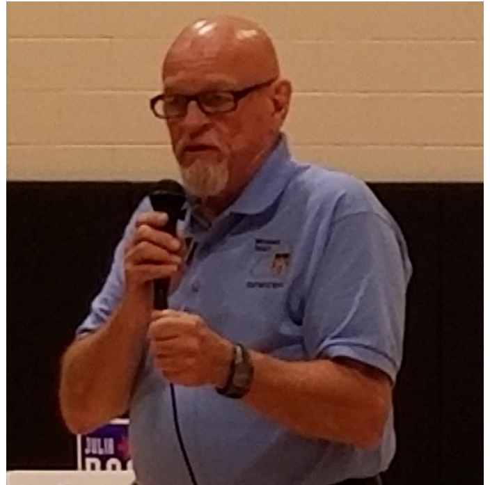
Convention Delegates cheered talks by