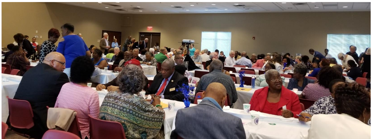
This picture shows part of the crowd of 200 Democrats at the Duplin Cake Auction.