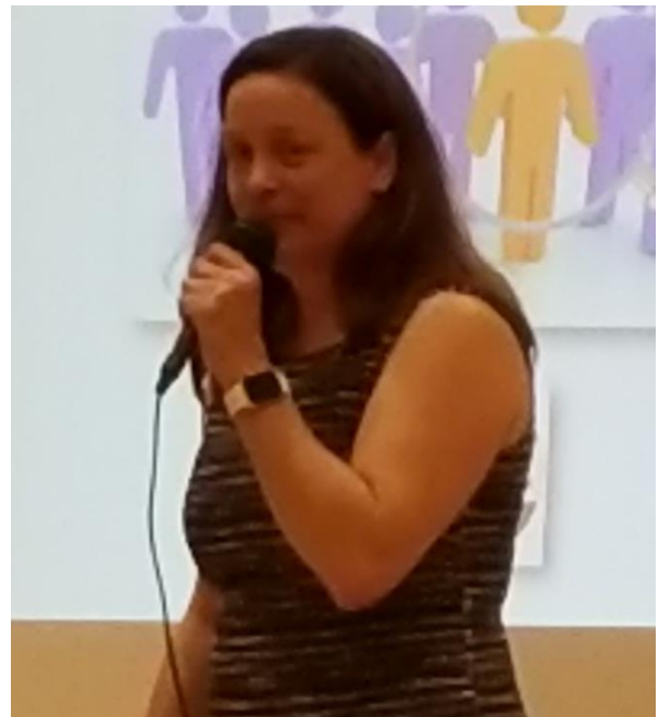
2020 US Senate candidate Eva F. Lee of Raleigh