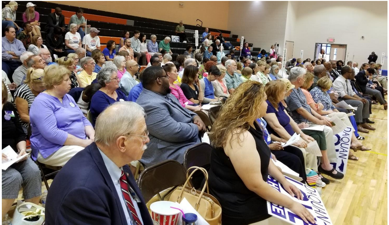
Part of the crowd at the Seventh Congressional District Convention