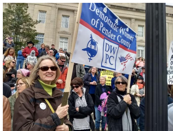
After the Convention, many of the Pender Democratic Women went to join the MARCH FOR OUR LIVES in Wilmington.