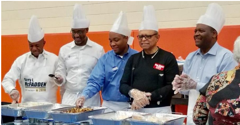
Public servants who REALLY SERVE!