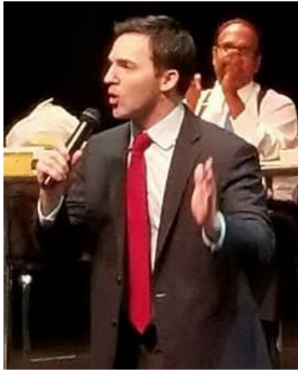
State Senator Jeff Jackson