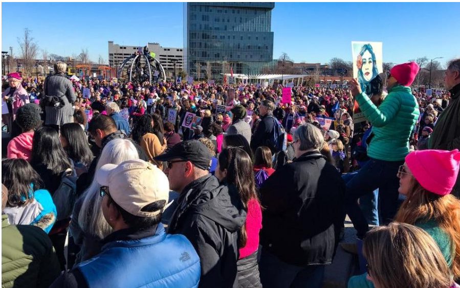
Part of the massive Charlotte crowd