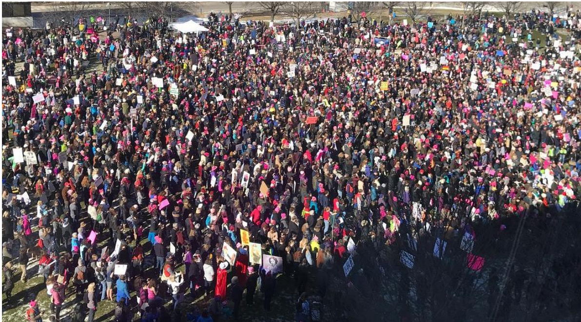
Thousands jammed into Halifax Mall for the Raleigh Rally!