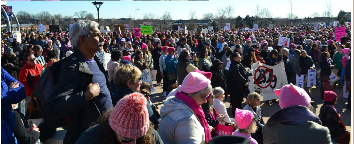
Part of massive Charlotte crowd!