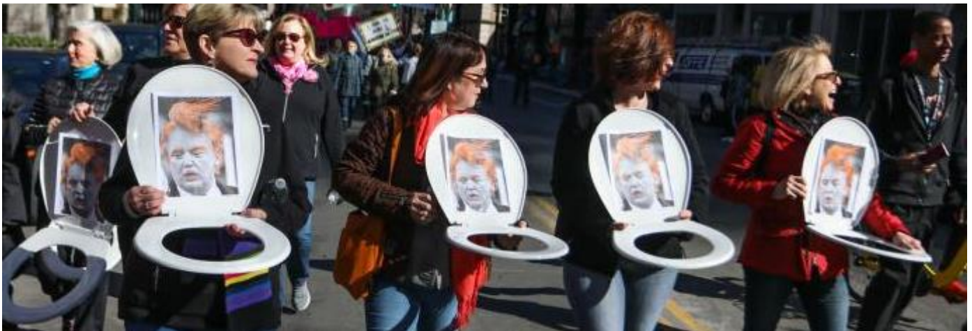
A clear message