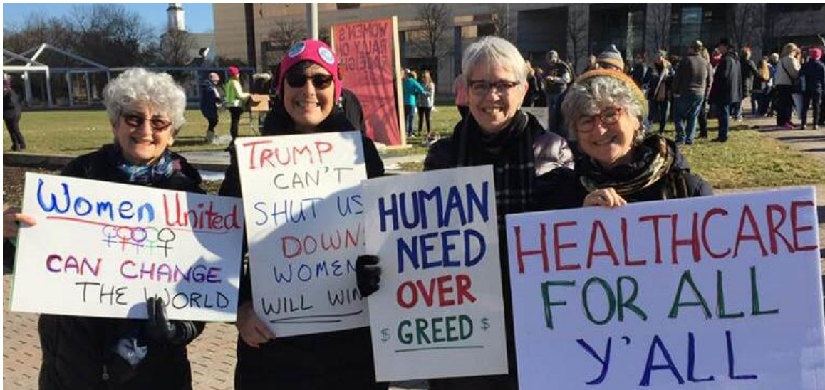
Democratic Women of Durham