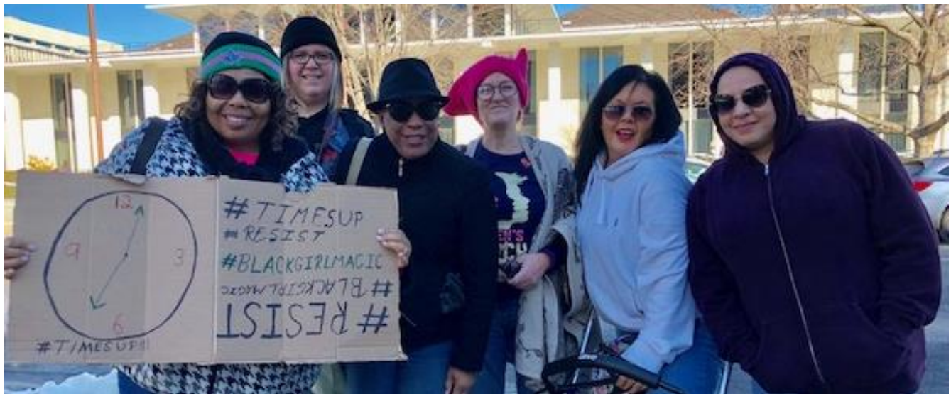
Democratic Women of Robeson County