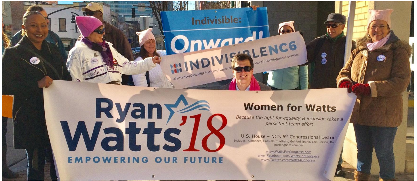
Supporters of Sixth Congressional District Candidate Ryan Watts proudly marched.