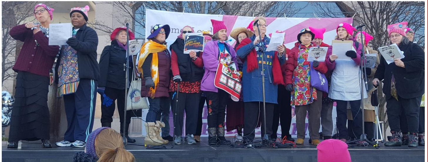
"The Raging Grannies" performed. They became famous during Moral Mondays.