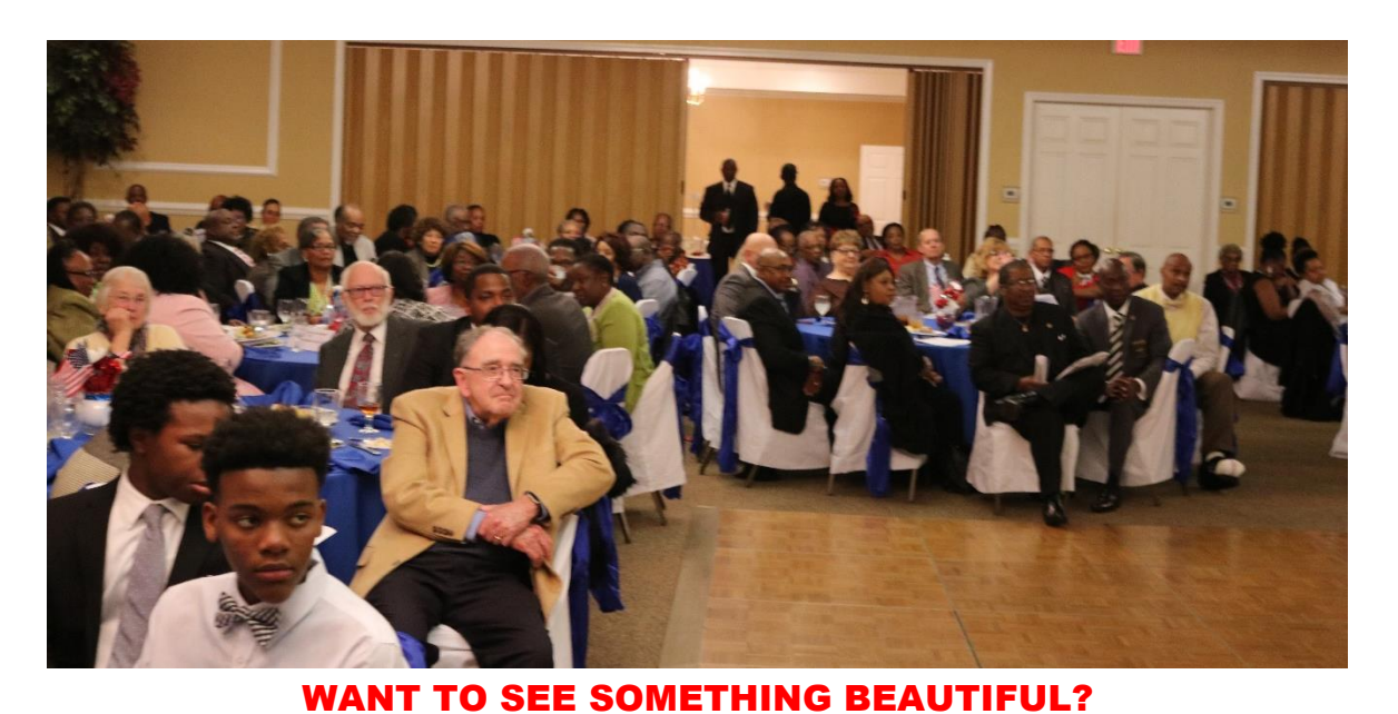
Look at all these Scotland County Democrats at their Purcell-Yongue Banquet!