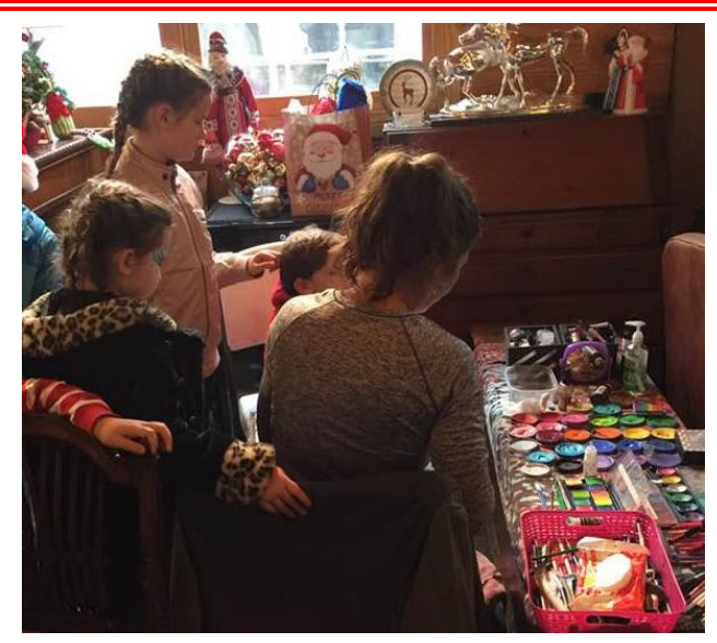
Many children enjoyed face painting!