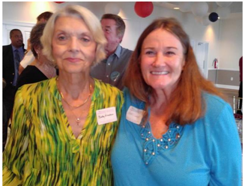
These Carteret Democrats enjoyed the celebration.