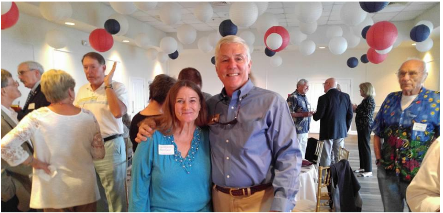
More pictures of Carteret County Democrats at the Donkey Dinner!