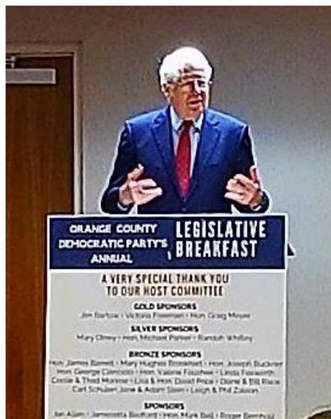
Congressman David Price