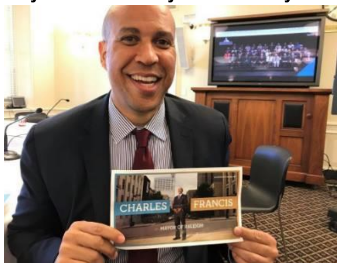
Senator Booker happily promotes the Charles Francis campaign.